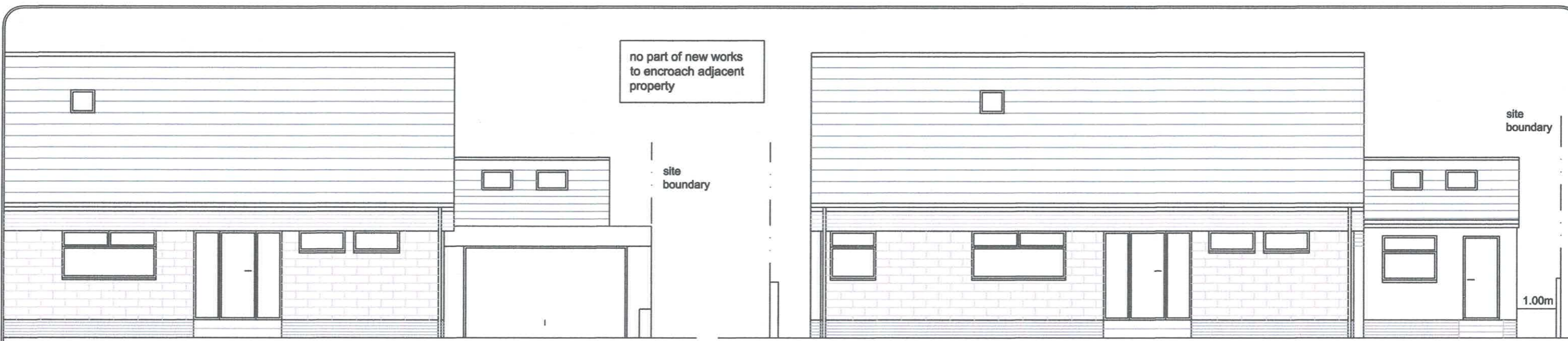
FRONT ELEVATION - STREET VIEW