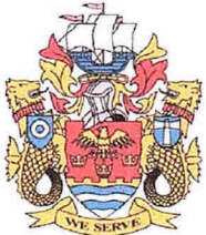
North Tyneside Council