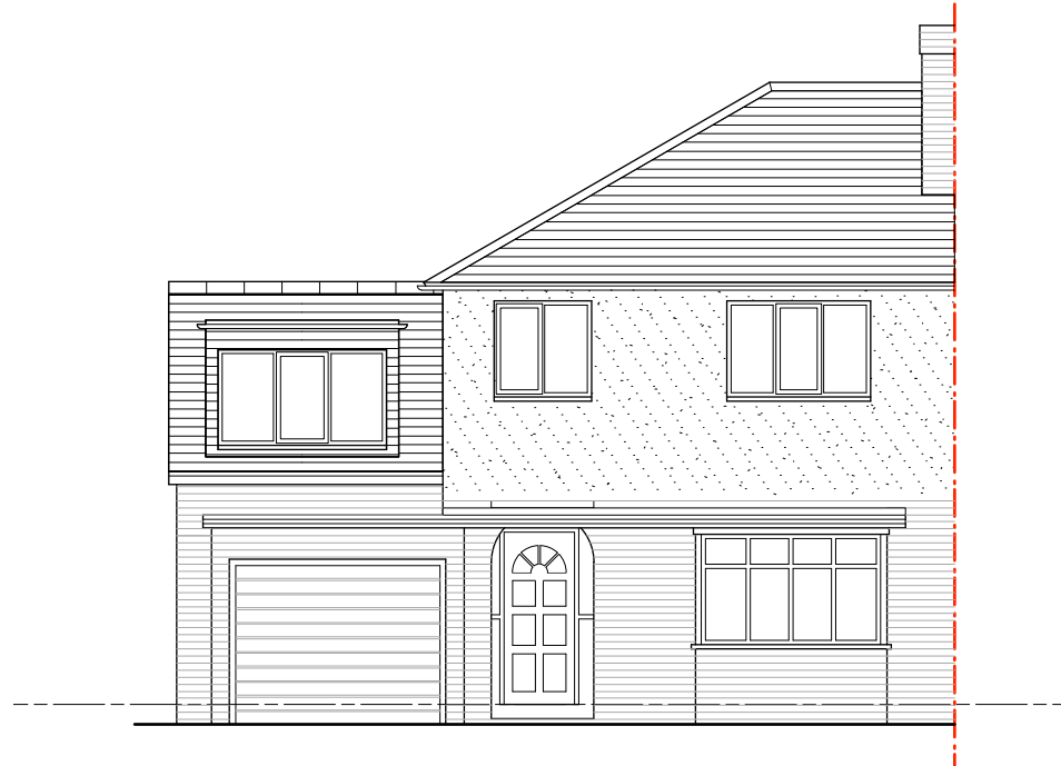
FRONT (SOUTH EAST) ELEVATION