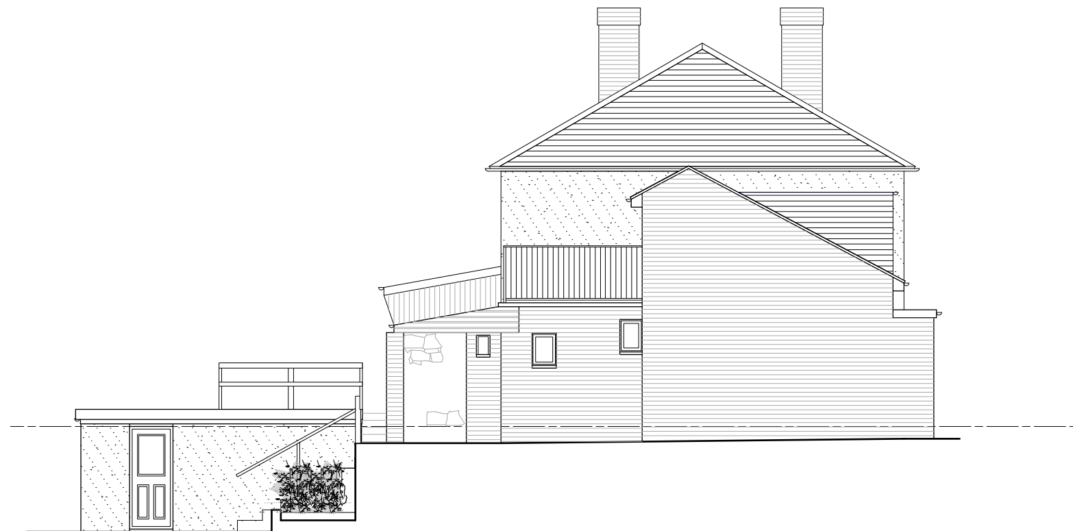
SIDE (SOUTH WEST) ELEVATION