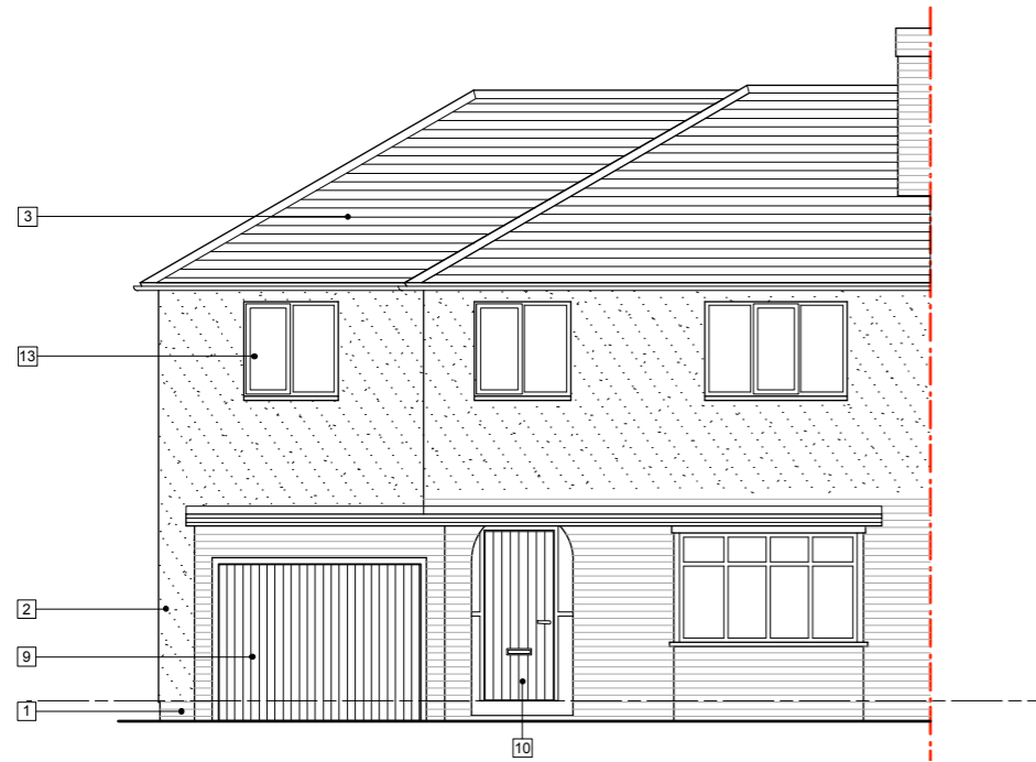
FRONT (SOUTH EAST) ELEVATION