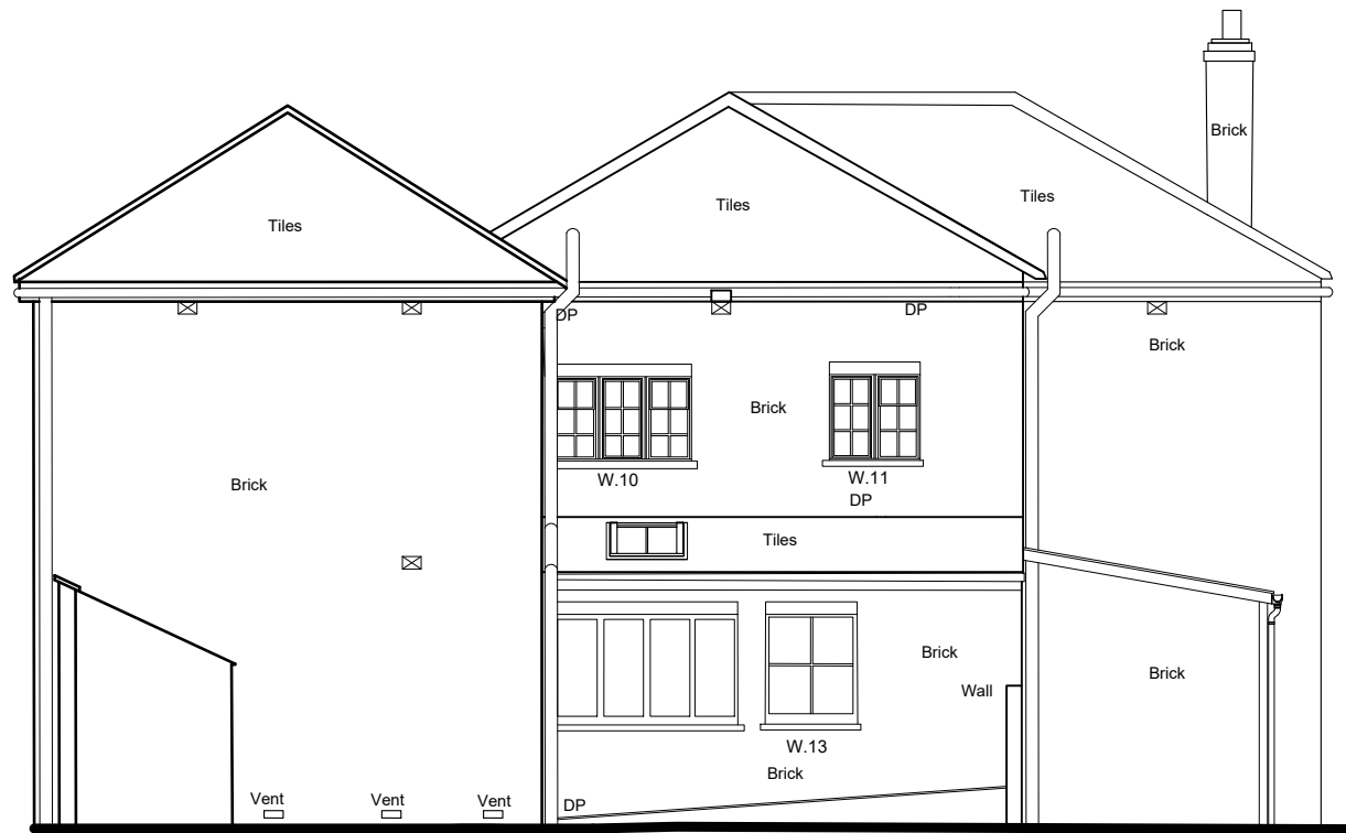
east (side) elevation main dwelling