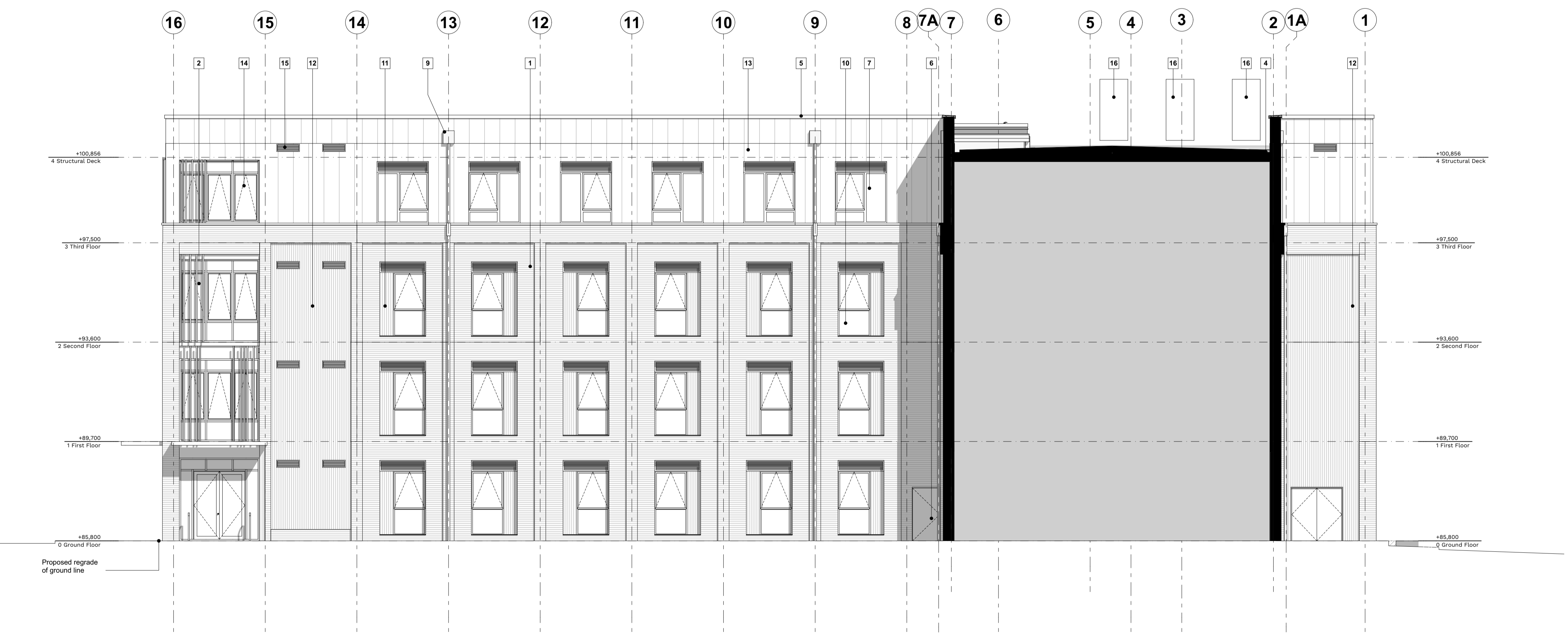
E20 Western Courtyard Elevation