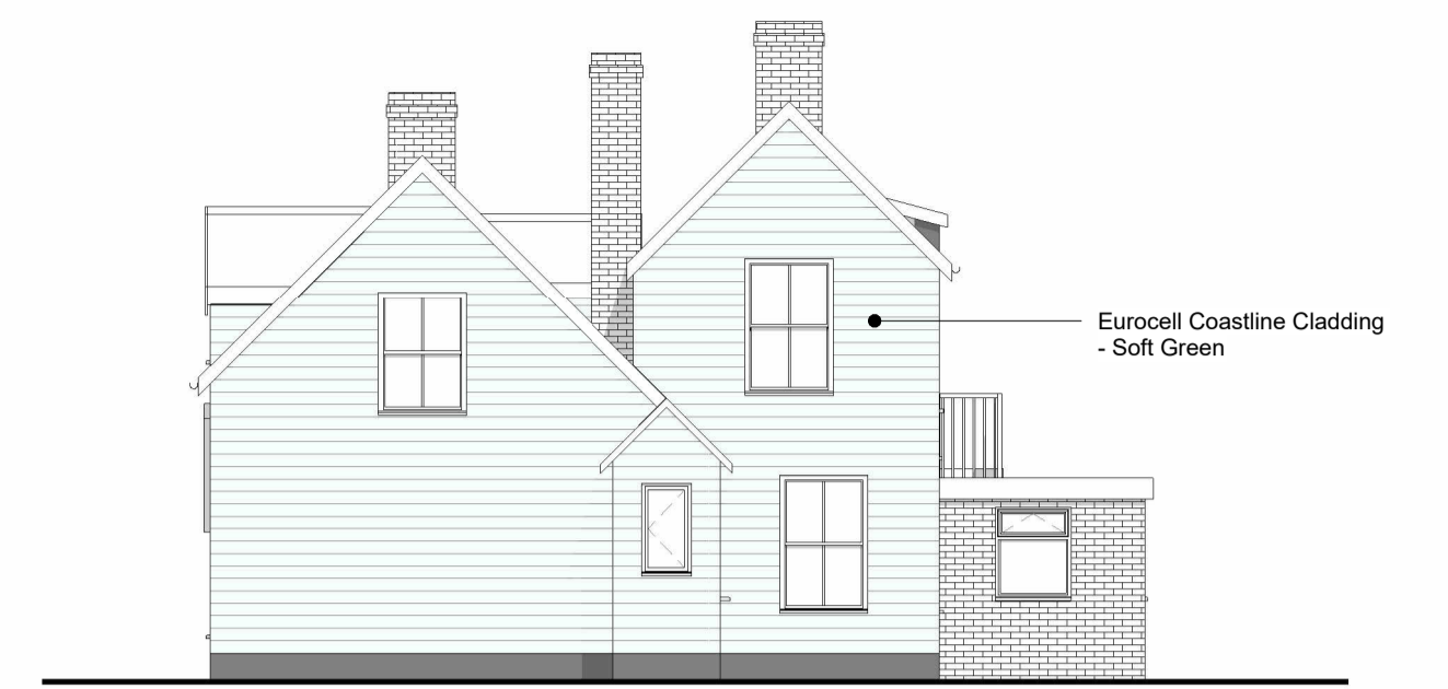
North Elevation as Proposed 1:100