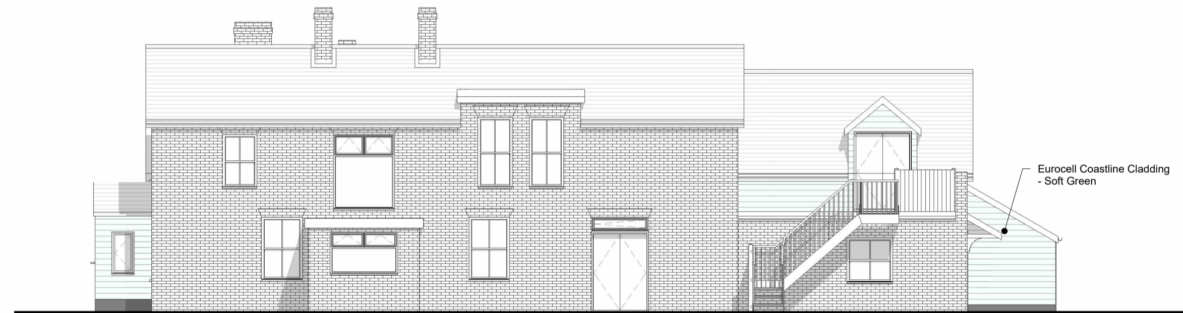
West Elevation as Proposed 1:100