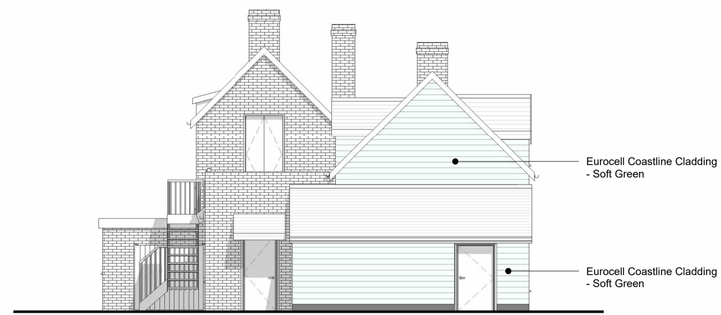
South Elevation as Proposed 1:100