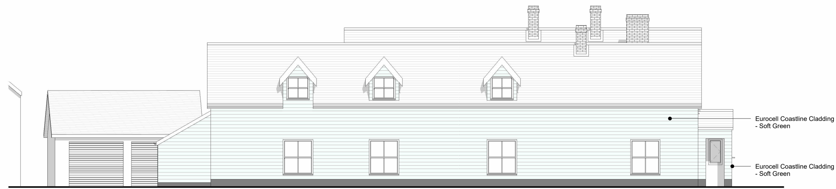
East Elevation as Proposed 1:100