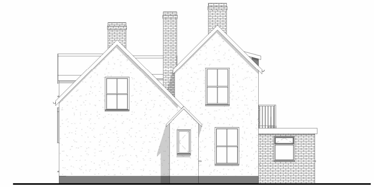
North Elevation as Existing 1:100