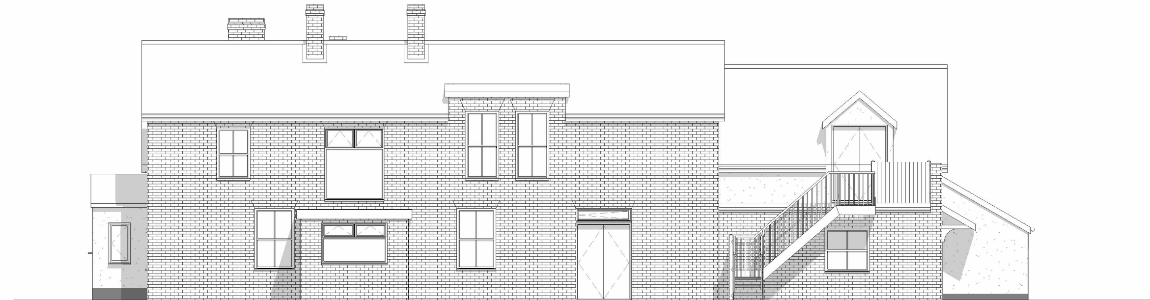
West Elevation as Existing 1:100