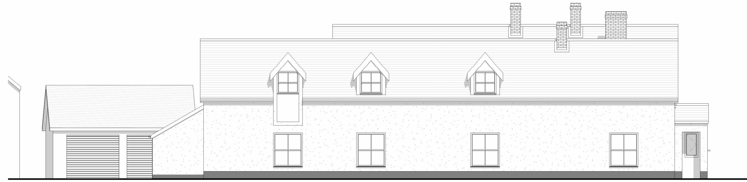
East Elevation as Existing 1:100