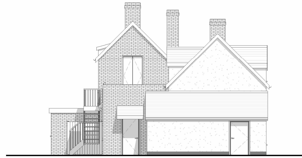
South Elevation as Existing 1:100