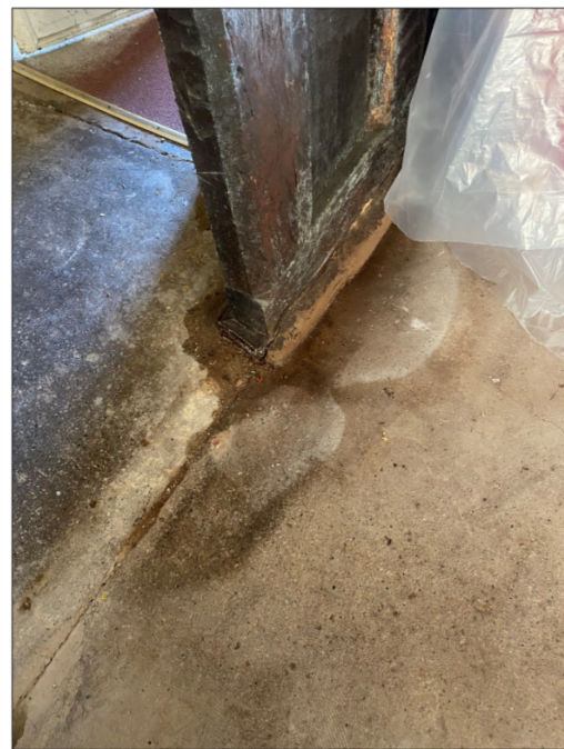
Image showing damp coming through the concrete floor against 15th Century oak plank and muntin screen