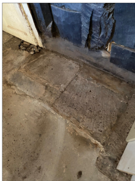
Image showing Historic Flagstone flooring, to be left in-situ without impact.

For Room 8 "As existing" details, please refer to drawing No. P01-0065-ISC-XX-00-DR-AR-005