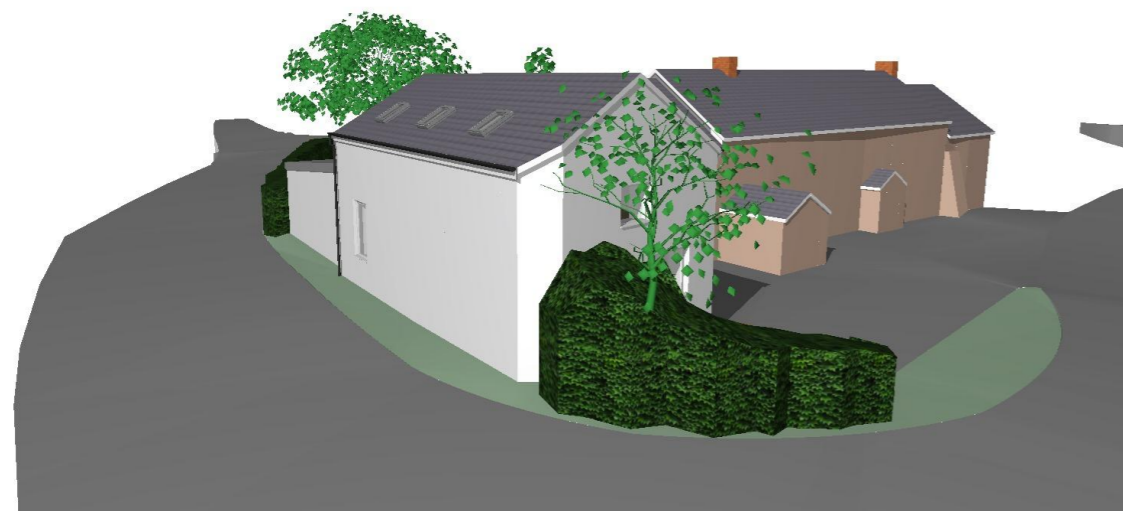
VIEW FROM ROAD