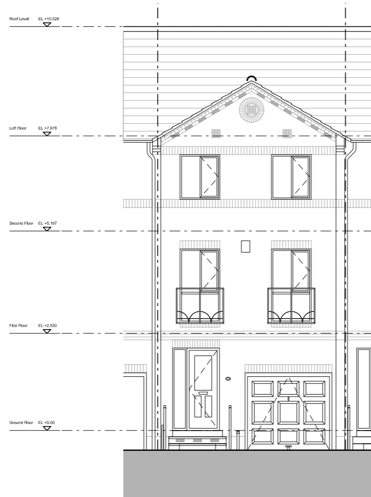
01 EXISTING FRONT ELEVATION