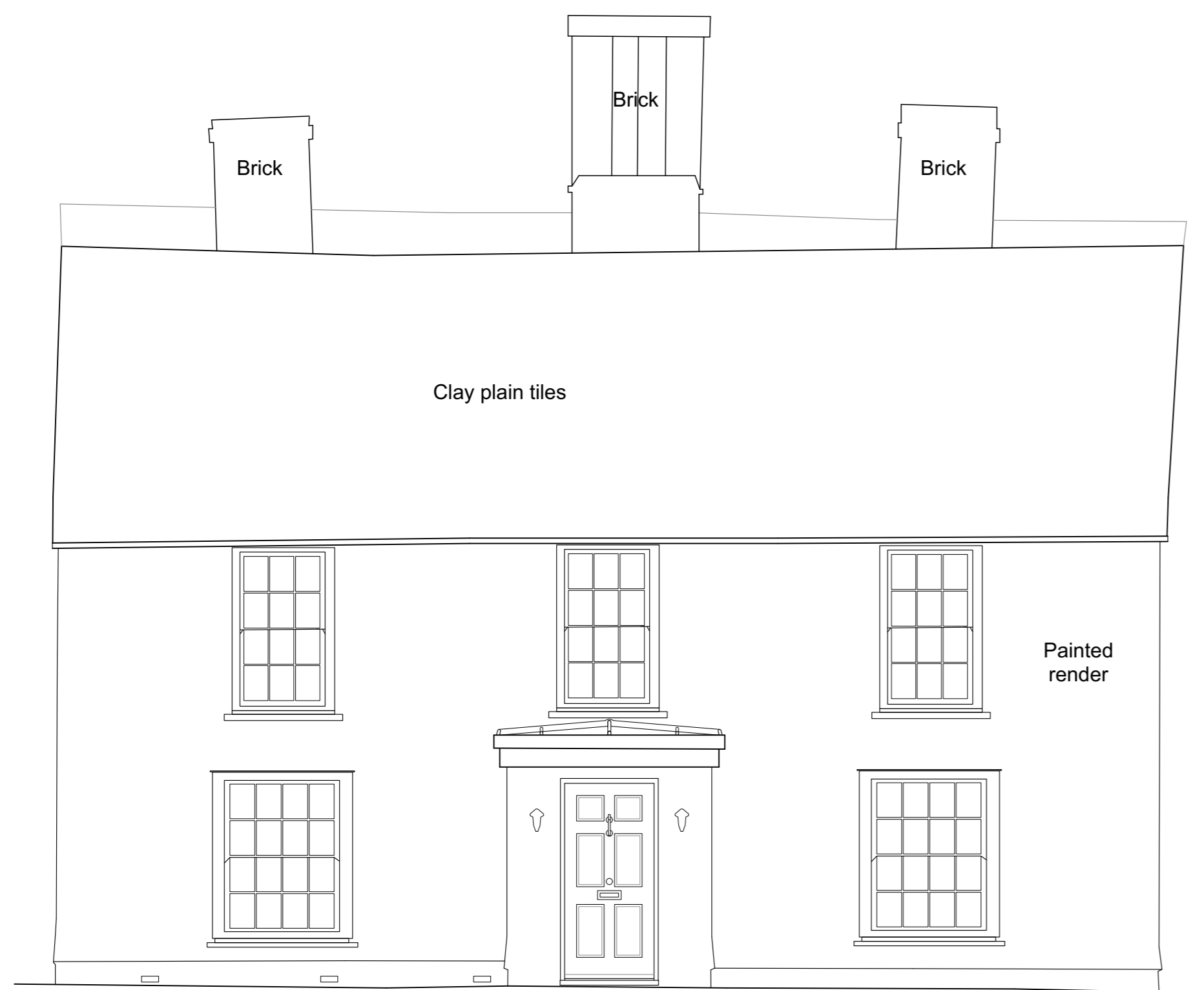
Existing North Elevation Scale 1:50 @ A1