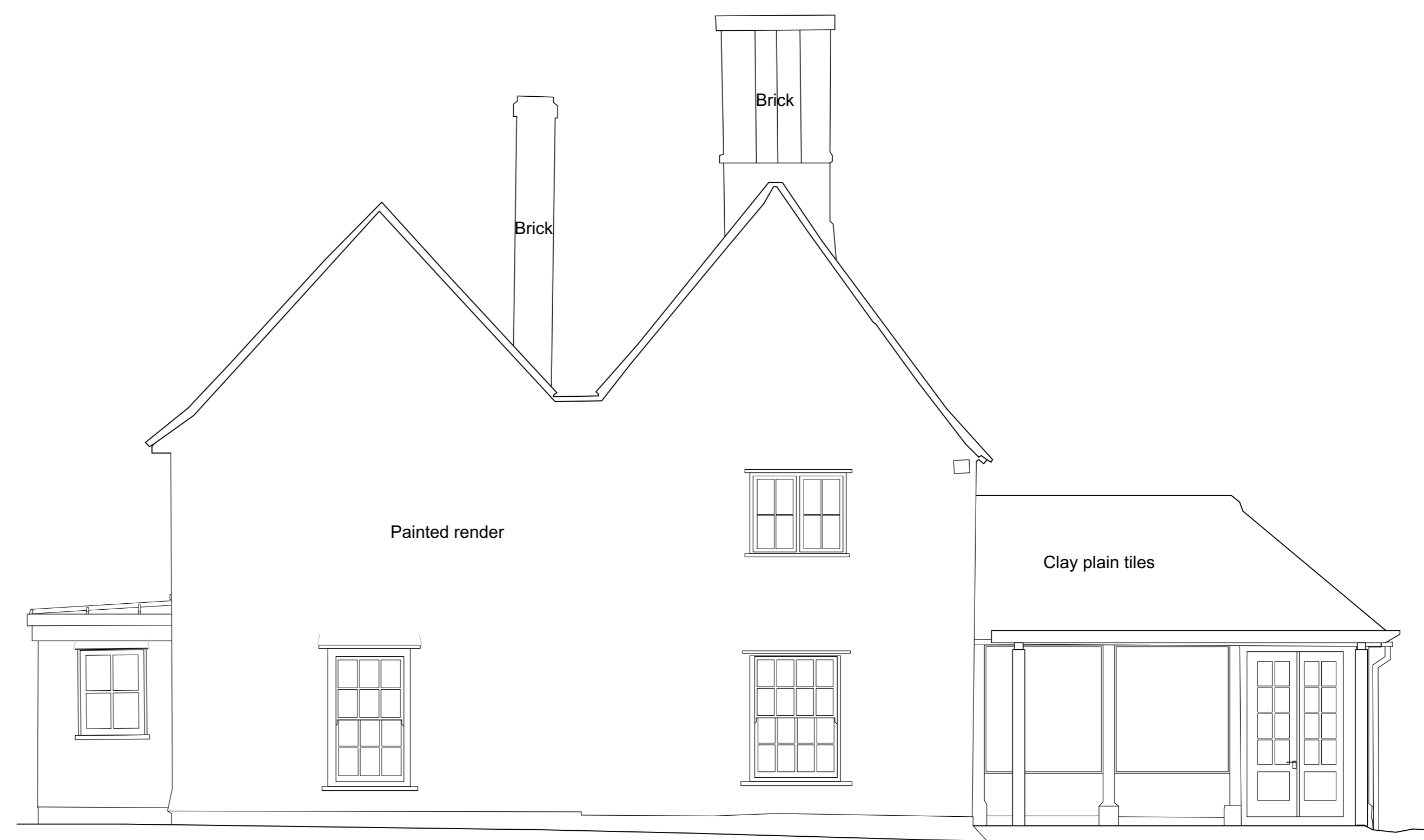
Existing West Elevation Scale 1:50 @ A1