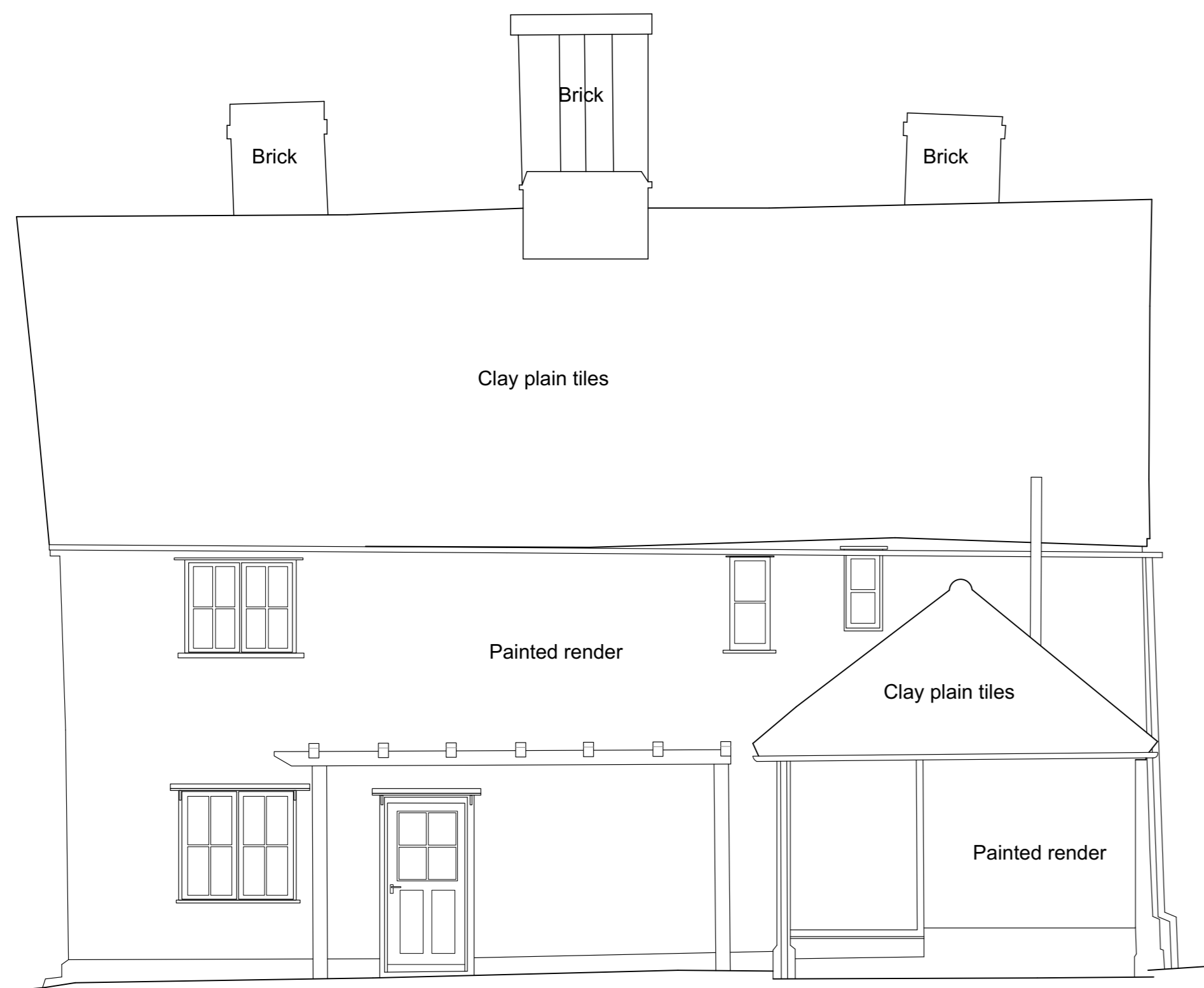
Existing South Elevation Scale 1:50 @ A1