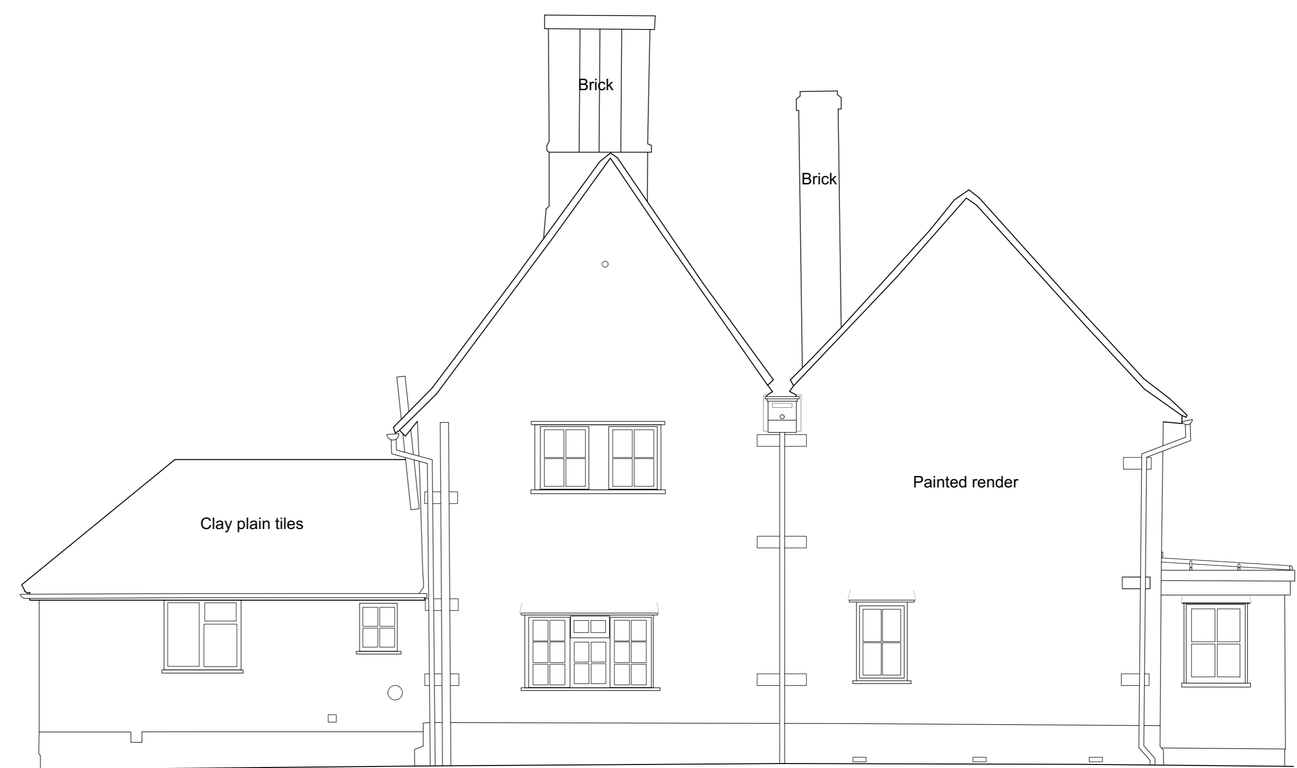
Existing East Elevation Scale 1:50 @ A1