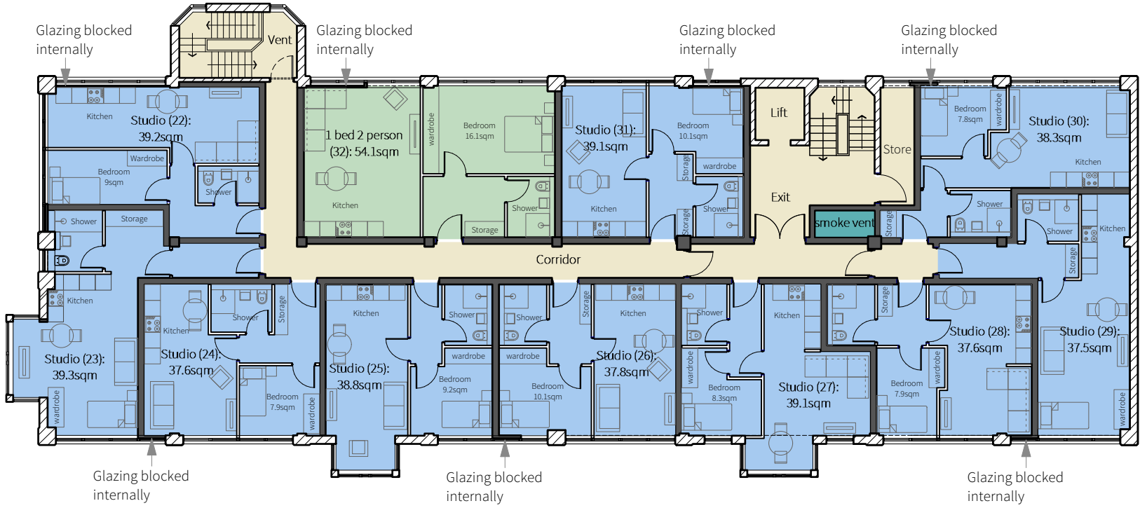
Proposed Second Floor Plan 1: 200 @ A3