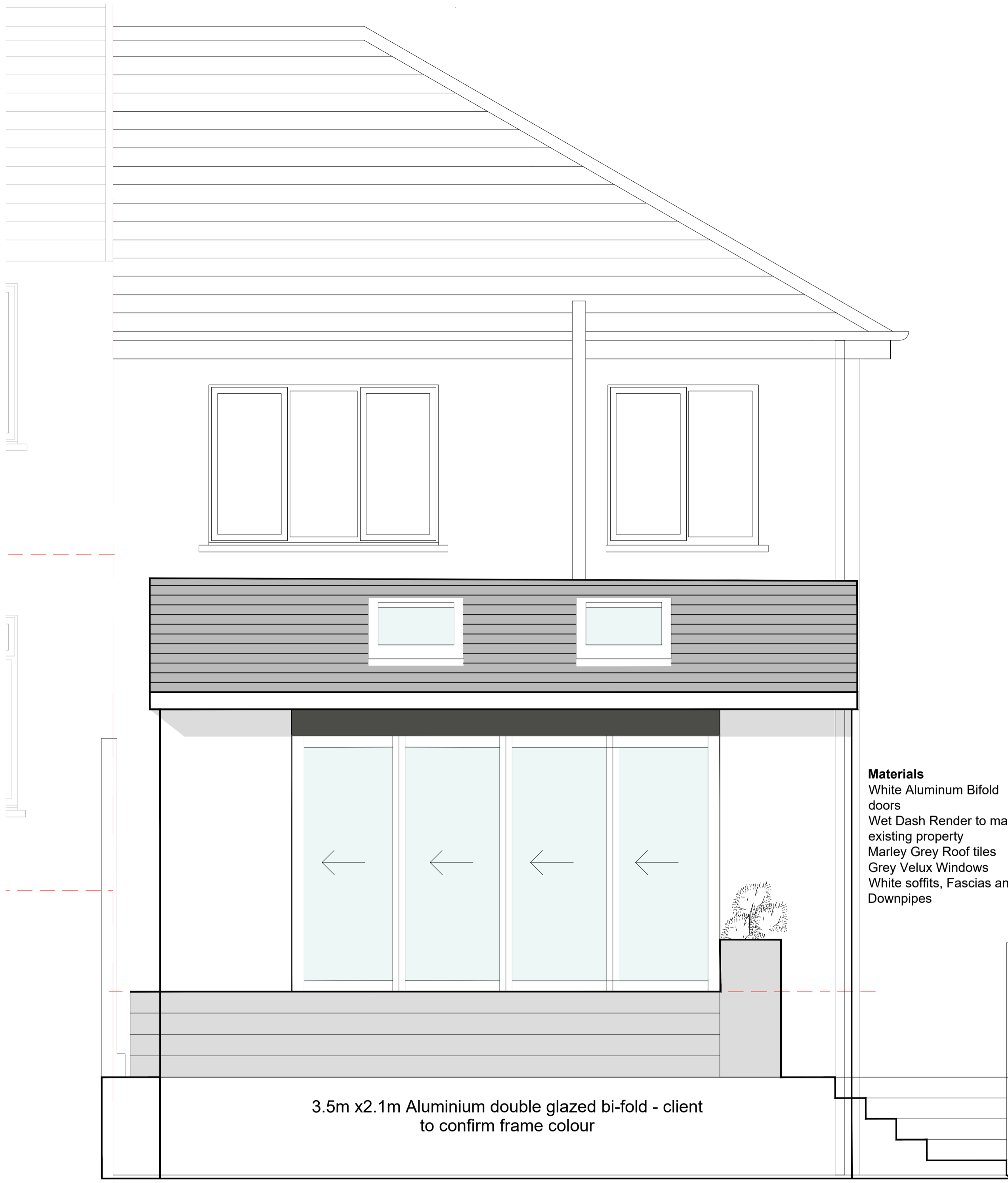
REAR ELEVATION 1.25

ALL DIMENSIONS TO BE CHECKED ON SITE DO NOT SCALE FROM THIS DRAWING USE FIGURED DIMENSIONS ONLY IF IN DOUBT ASK THIS DRAWING IS THE COPYRIGHT OF THE ARCHITECT, AND SHOULD NOT BE REPRODUCED IN ANY FORMAT WITHOUT PRIOR APPROVAL.