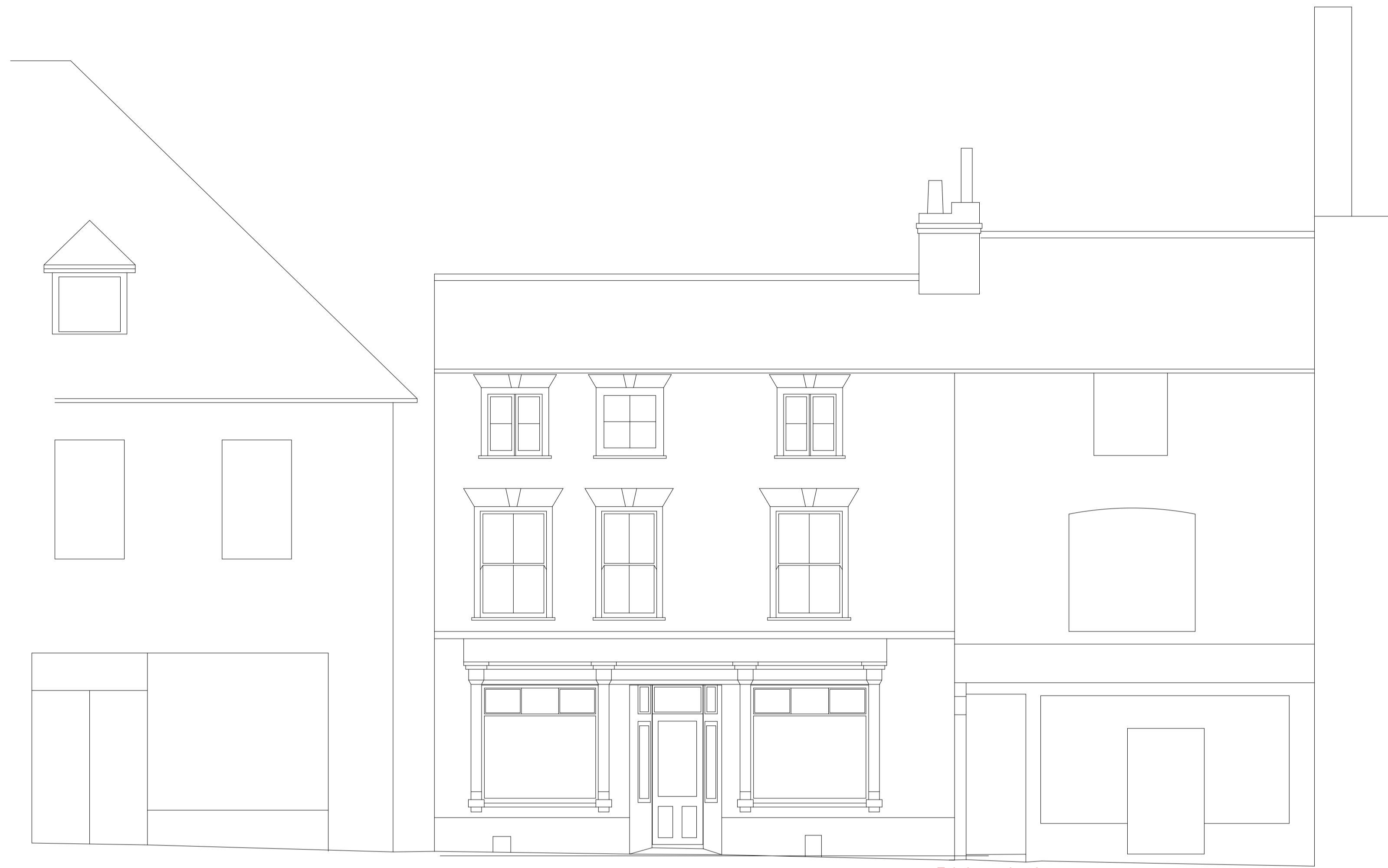
103.0m DATUM SOUTH ELEVATION