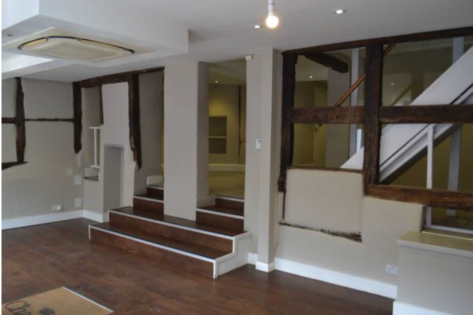
Entrance Ground Floor Commercial Unit to be retained