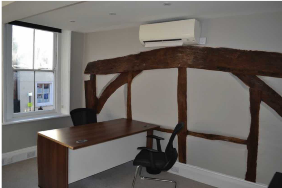
First Floor Front Room, timbers not affected by the works