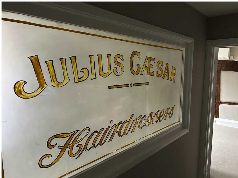
First Floor Modern Partition to be removed