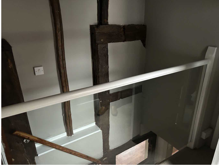
First Floor Rear Room Kitchen removed to form bedroom. Fireplace retained.