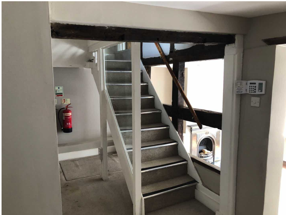
Modern Stair to be replaced and new stud walls retaining all timber framework