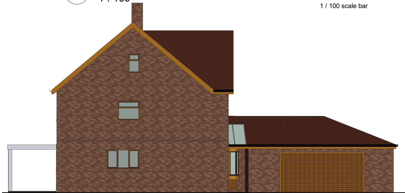
4 West Elevation 1 : 100