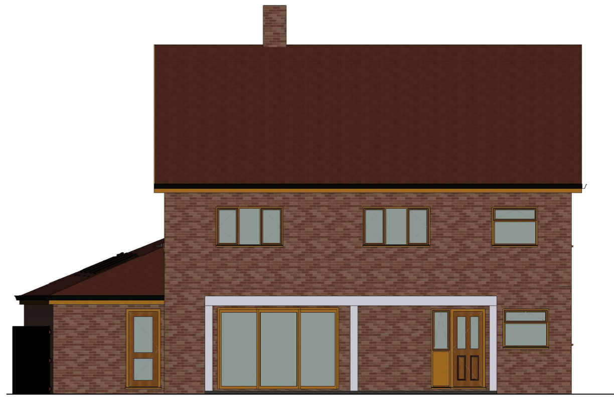
2 North Elevation 1 : 100