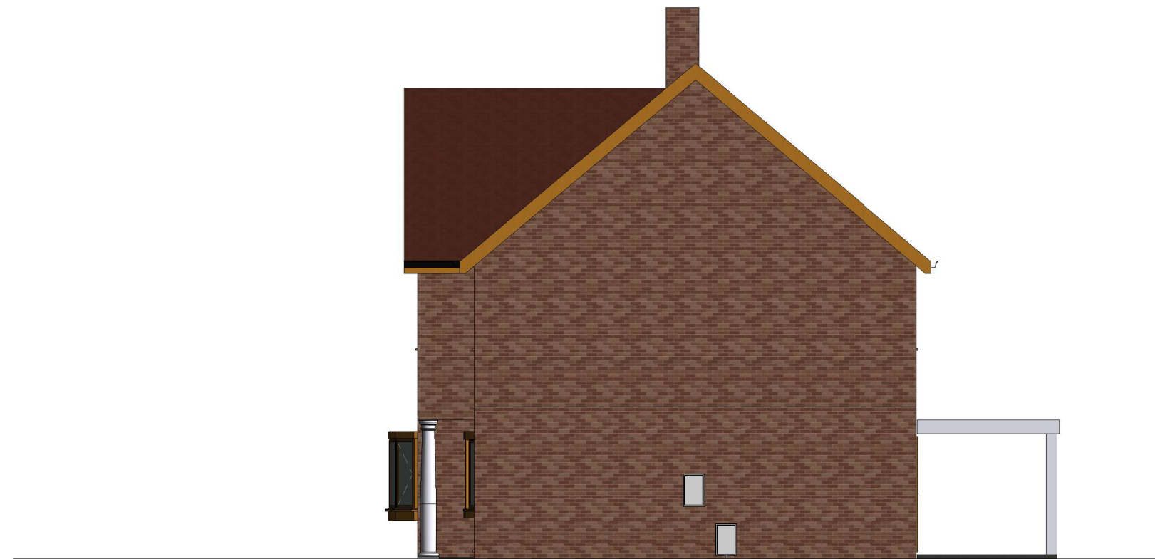
1 East Elevation 1 : 100