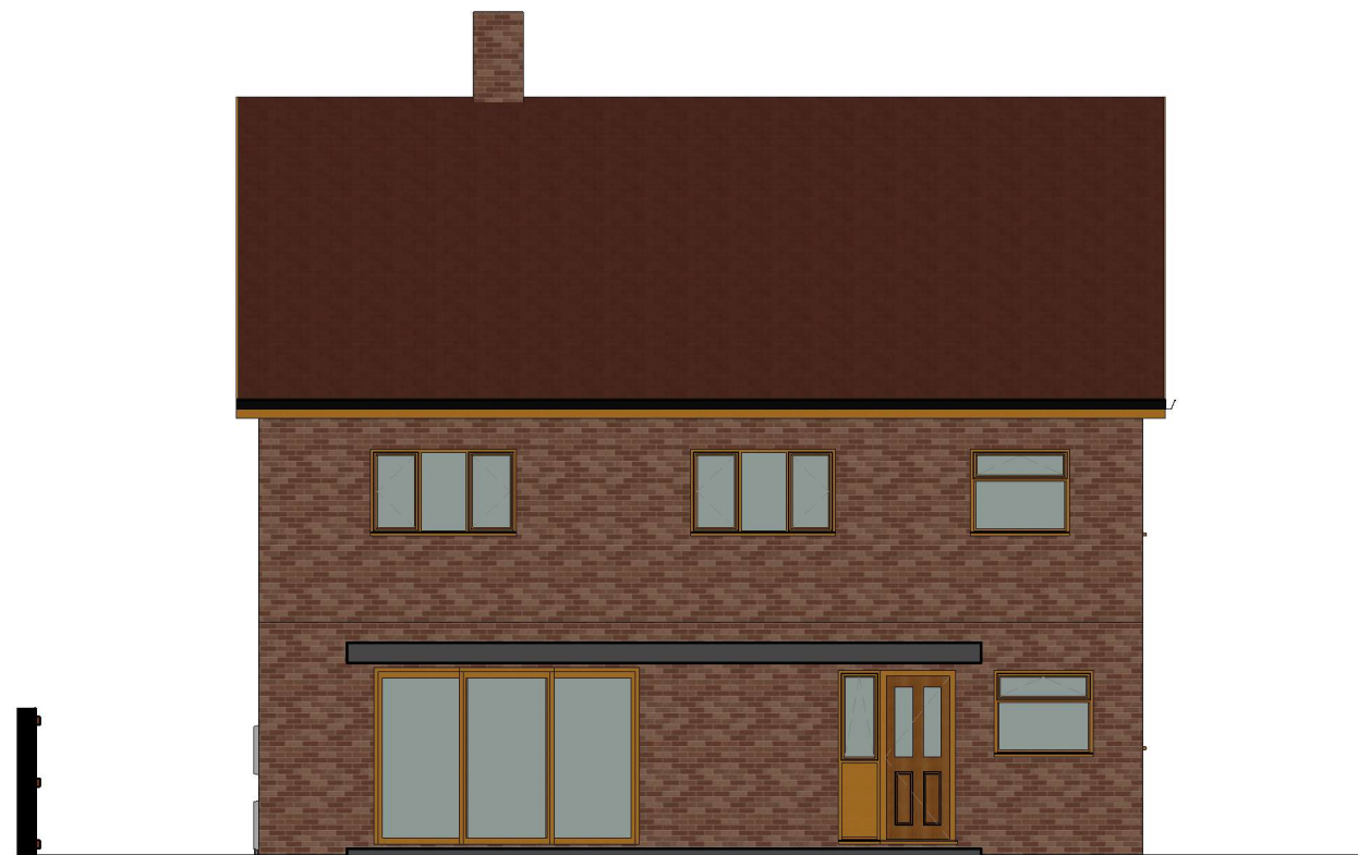
2 North Elevation 1 : 100