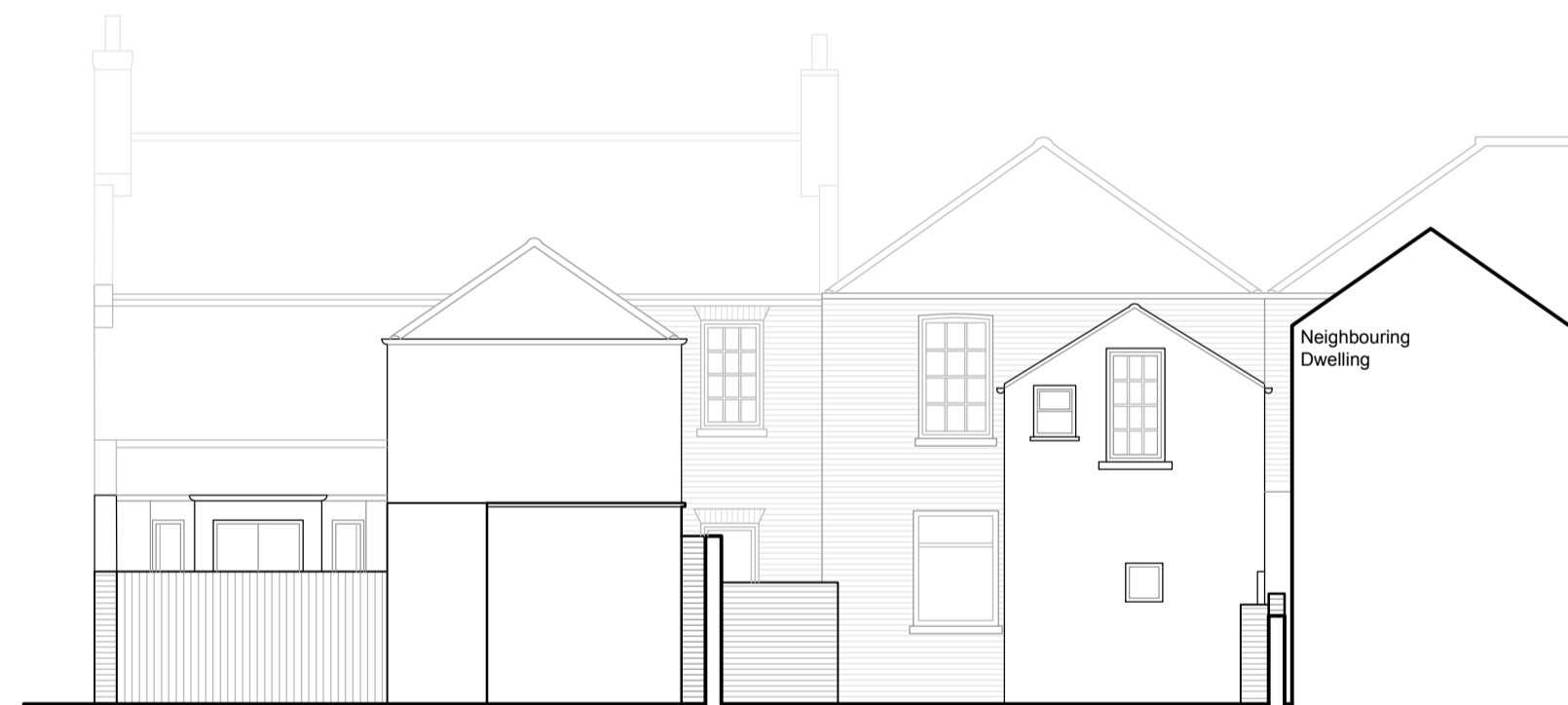
Existing North Elevation Scale 1:100