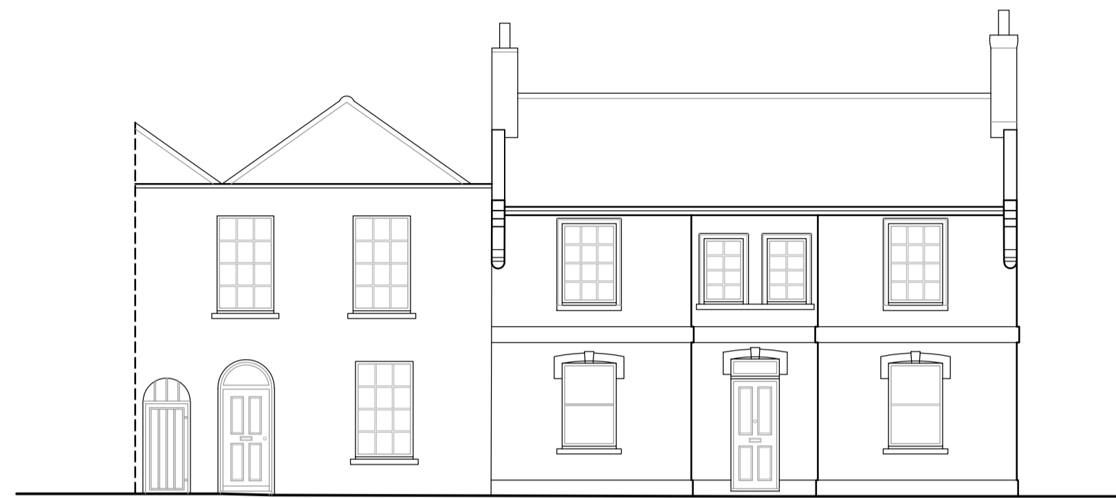
Existing South Elevation Scale 1:100