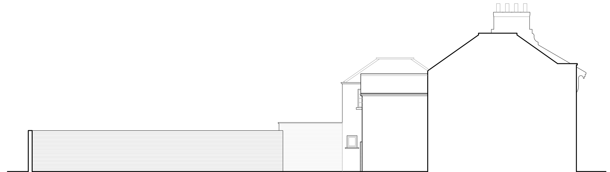
Existing South Elevation Scale 1:100