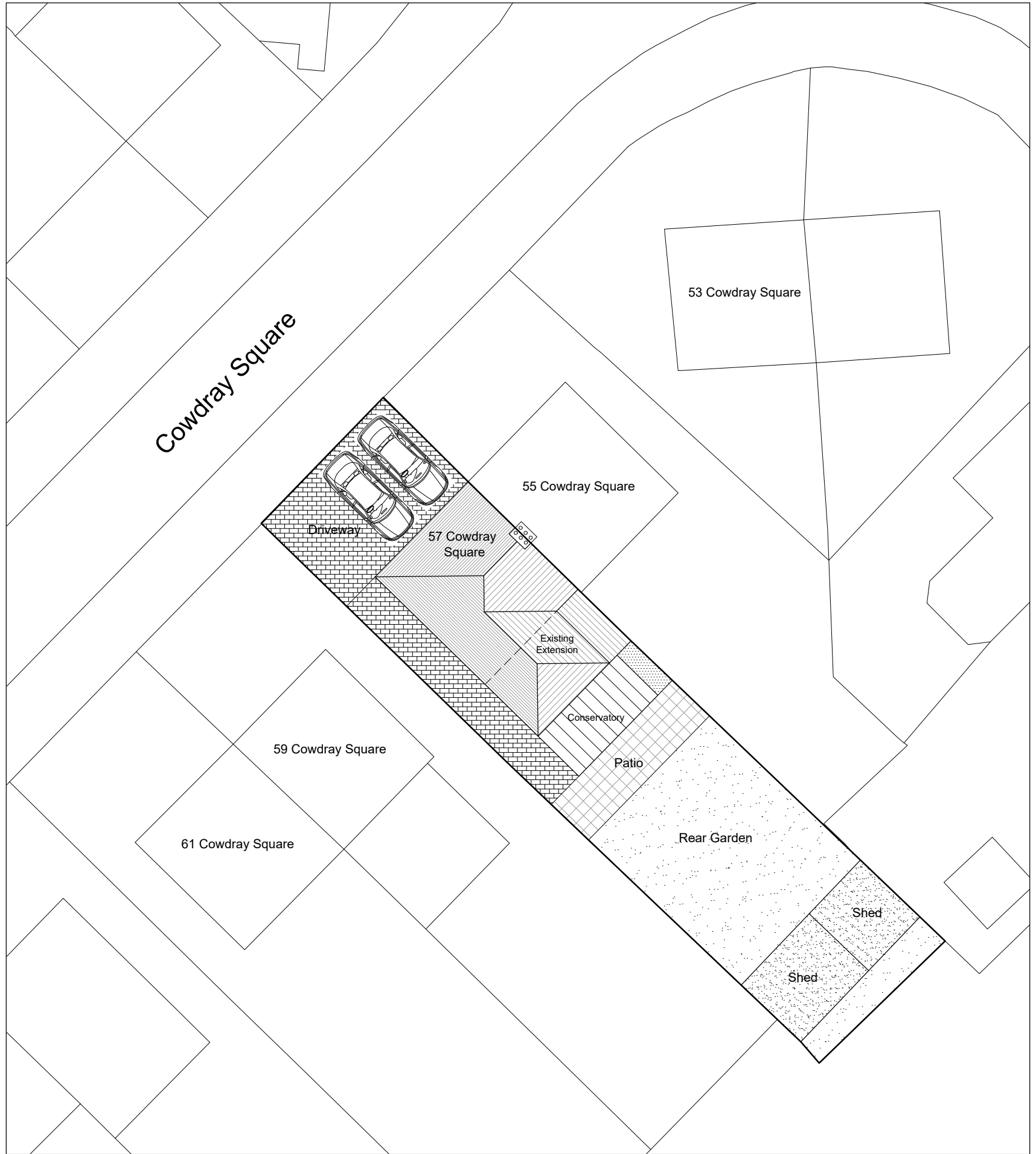
Existing Site Block Plan Scale 1:200