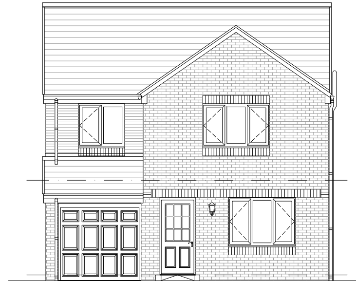
FRONT ELEVATION (as existing) 1:100 @ A3