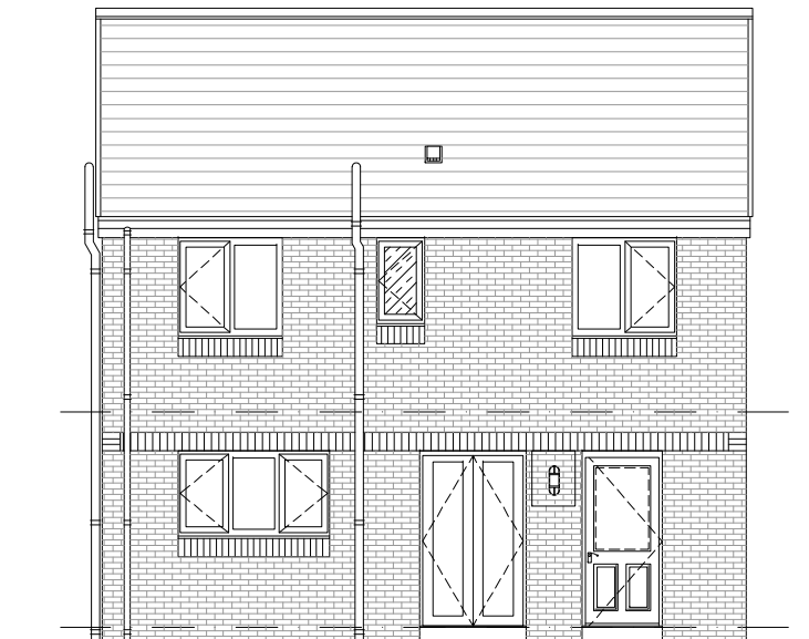
REAR ELEVATION (as existing) 1:100 @ A3