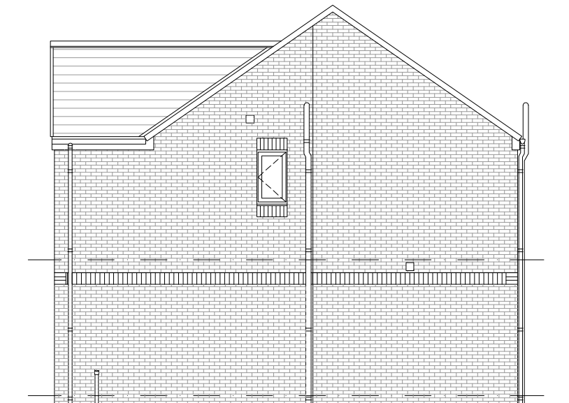
SIDE ELEVATION (as existing) 1:100 @ A3