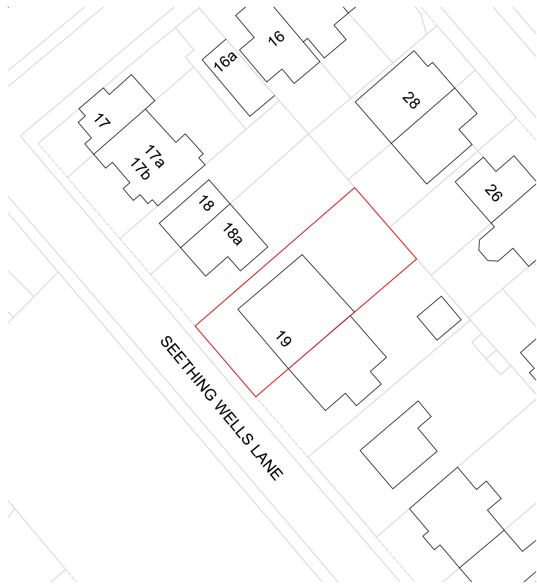
Site Plan - Scale 1:500@A3