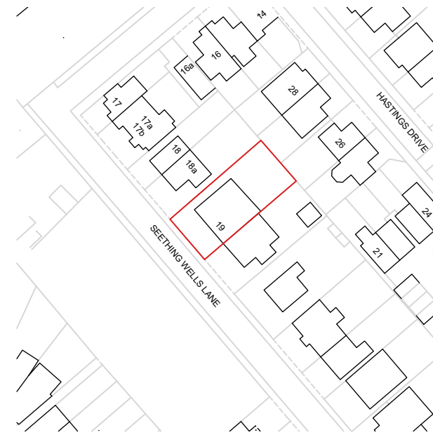
Location Plan - Scale 1:1250@A3