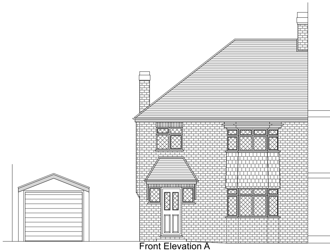
Front Elevation A