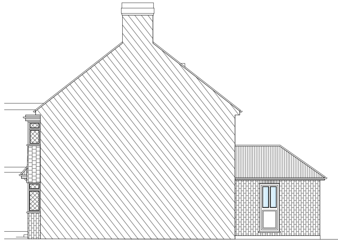
Side Elevation B