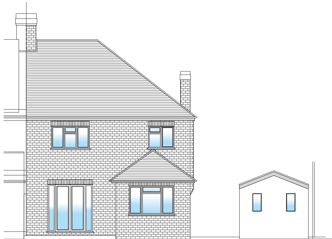
Rear Elevation C