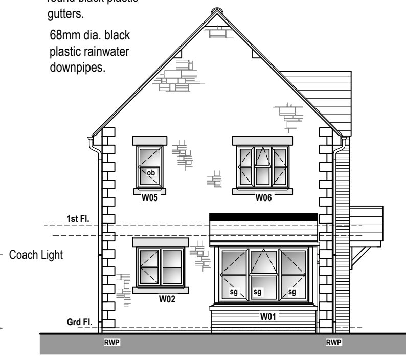
SIDE ELEVATION (Street Elevation)

Soffit and barge boards - finish White. 110mm dia. half round black plastic gutters. 68mm dia. black plastic rainwater downpipes.