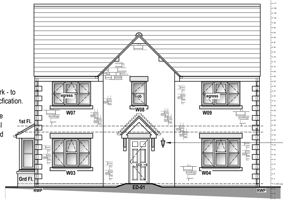
Disabled 'LEVEL' access to door D-01, refer separate details FRONT ELEVATION (Street Elevation)

Coursed stonework - to current client specification. Lead flashing to be bonded to external wall face with Lead Mate sealant.