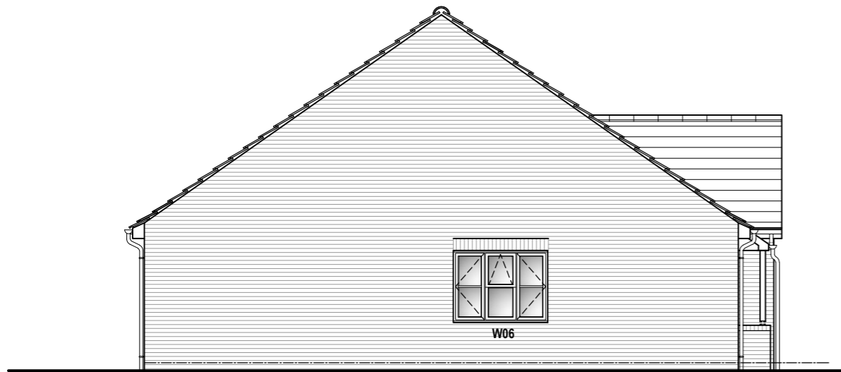
LEFT GABLE ELEVATION

PROPERTY MISDESCRIPTIONS ACT 1991 (Warning to House Purchasers) These drawings, and their contents, are for 'Construction' purposes only and may be subject to change at any time. Alterations and Variations may occur during the construction process, and therefore the layout, form, content, and dimensions of the completed construction may vary from that shown on these drawings. Every effort is made to constantly update the information shown however there may be situations of unavoidable delay due to changes in Statutory Regulations and/or re-planning. Purchasers are advised to check with the Sales Team to ascertain whether there have been any alterations to the printed information.