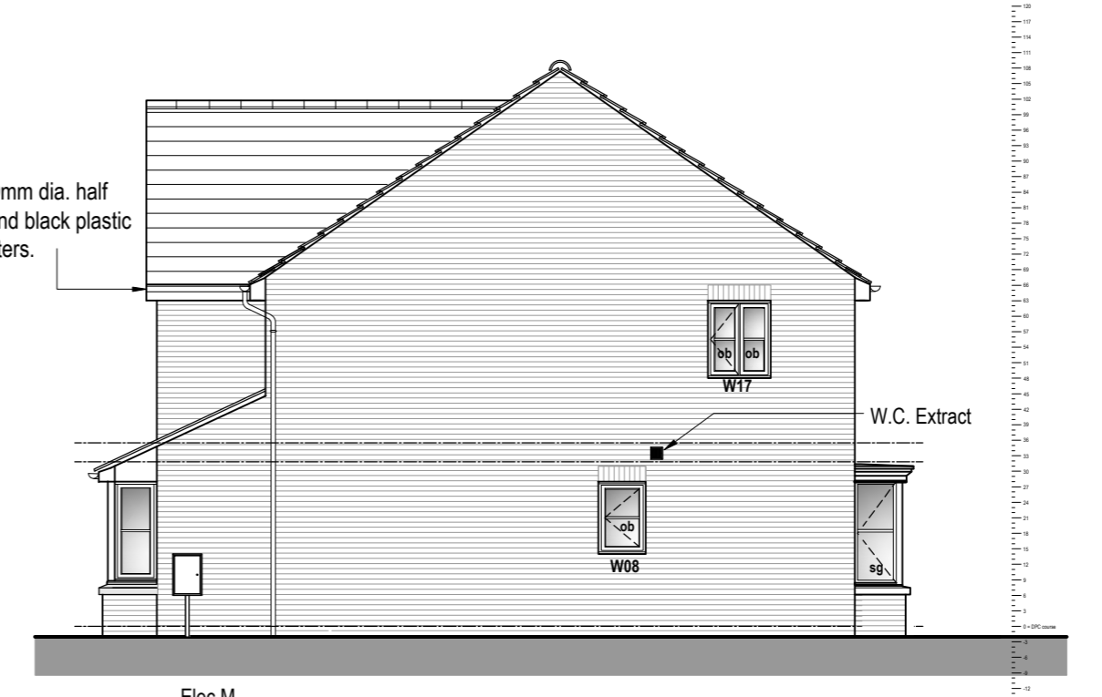
RIGHT GABLE ELEVATION