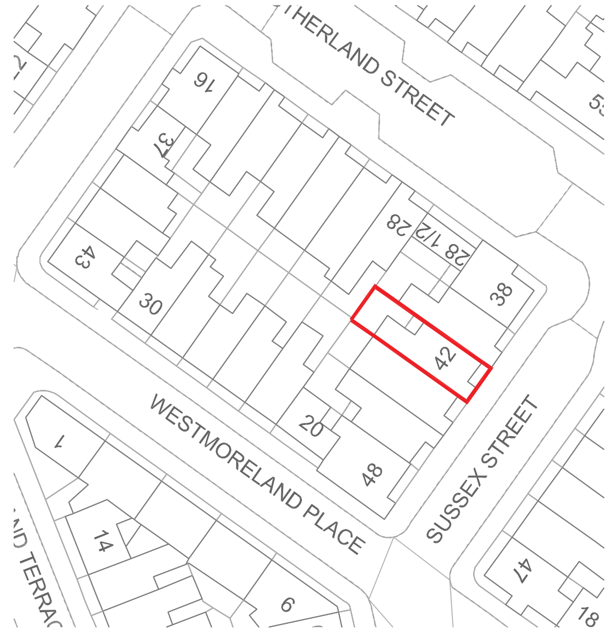
2 BLOCK PLAN