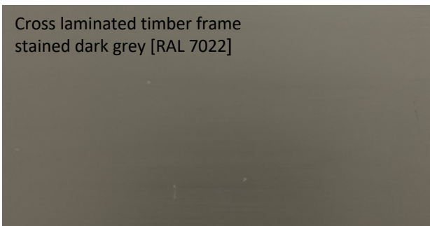
Cross laminated timber frame stained dark grey [RAL 7022]

Dark grey main timber frame with white rendered walls. All external walls have a U-Value of 0.17 W/(m 2 K).