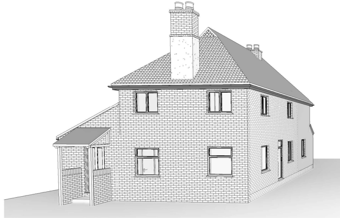
1 Existing Front