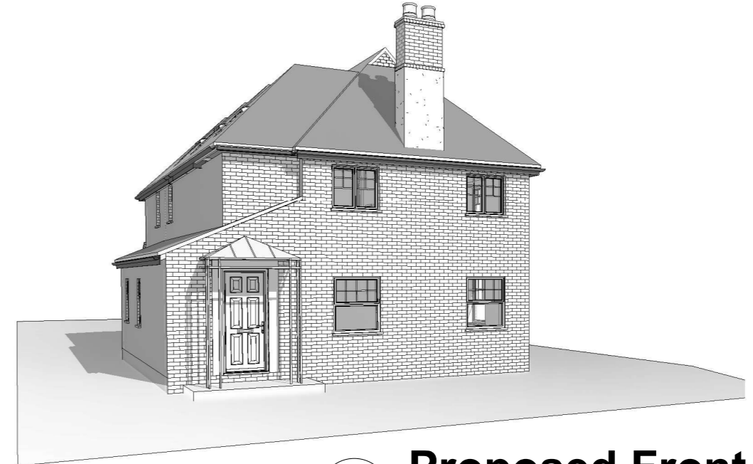
4 Proposed Front