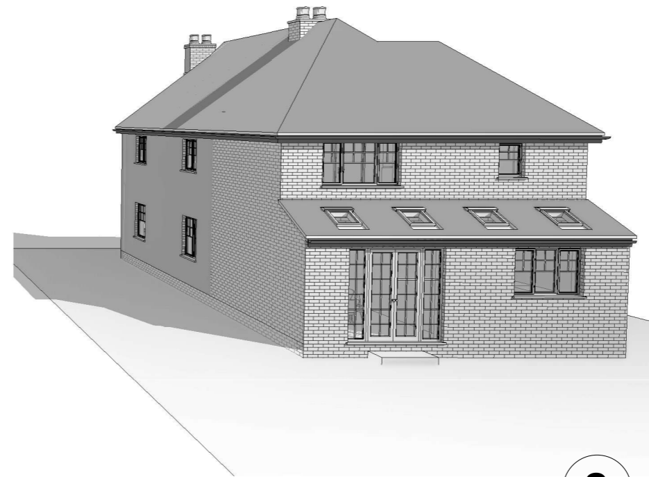
2 Proposed Rear