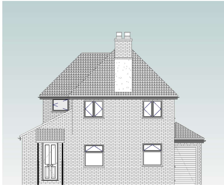
E1 Existing Front 1 : 100