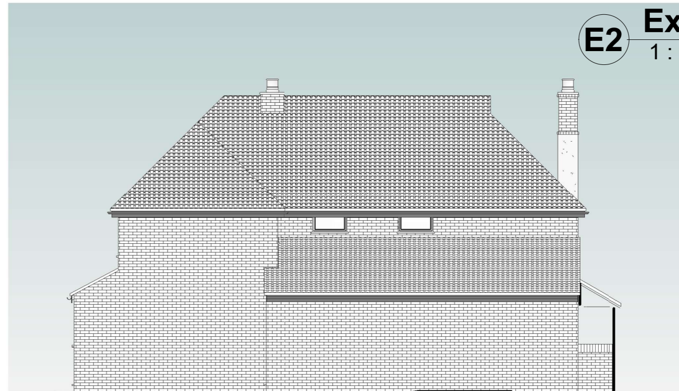
E2 Existing LHS 1 : 100