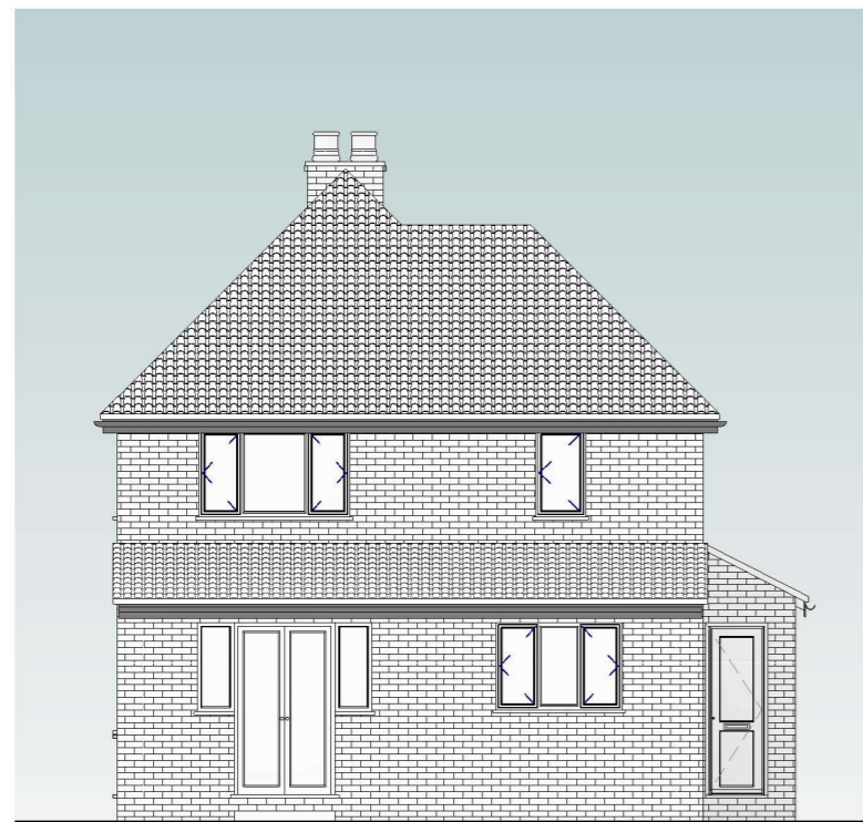
E3 Existing Rear 1 : 100