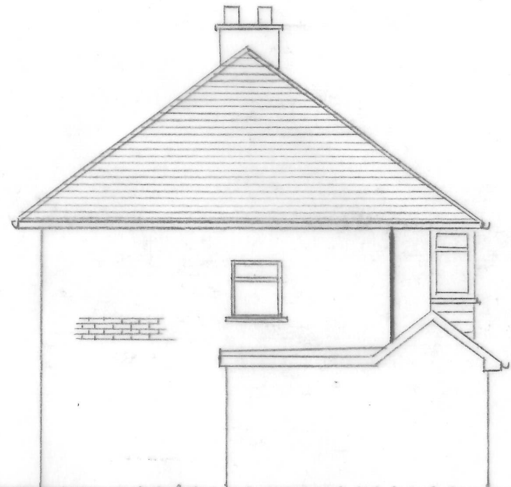
EXISTING SIDE ELEVATION 1