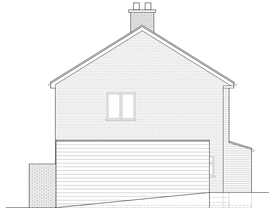
EXISTING SIDE ELEVATION-2