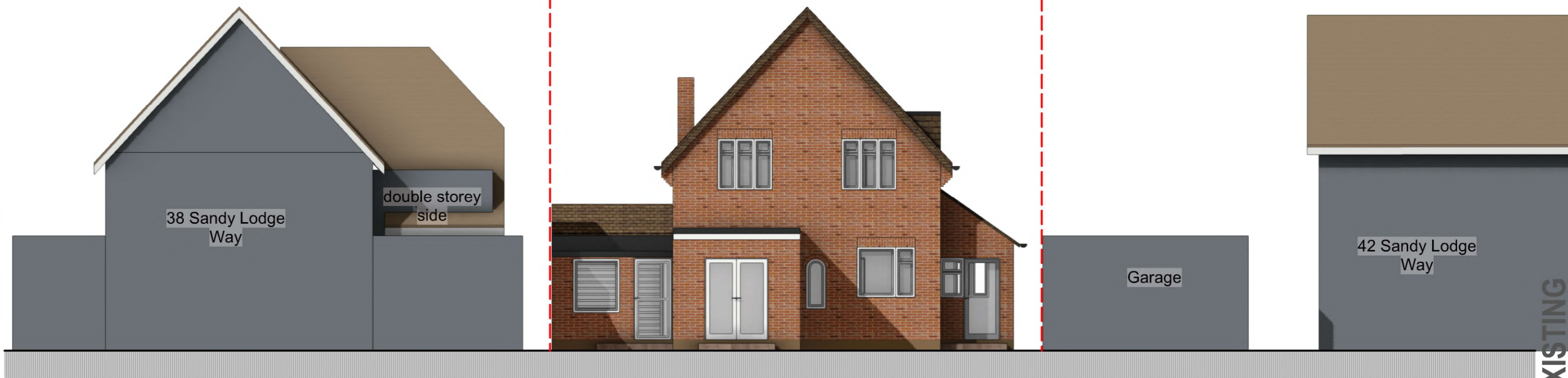
2 EXG ELEVATION REAR Scale: 1:100