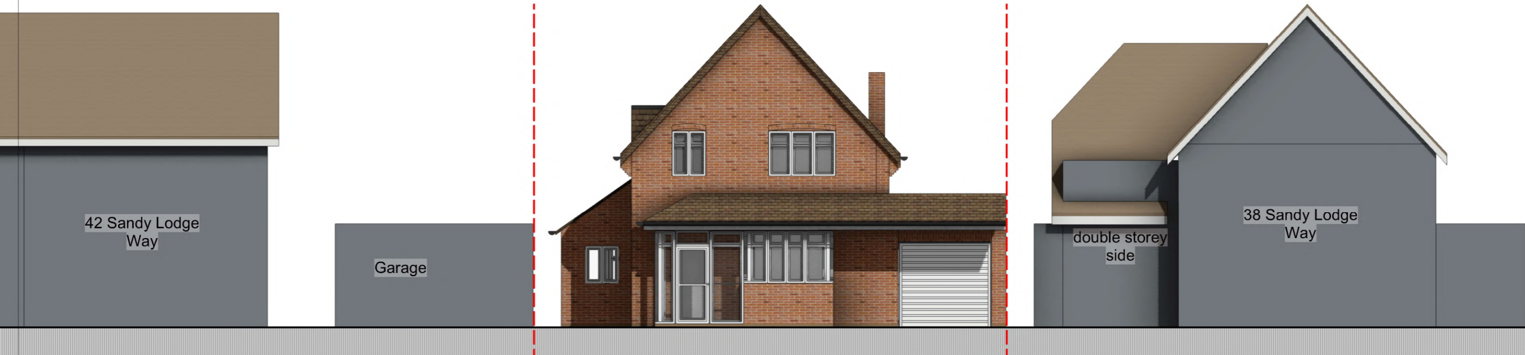
01 EXG ELEV FRONT Scale: 1:100