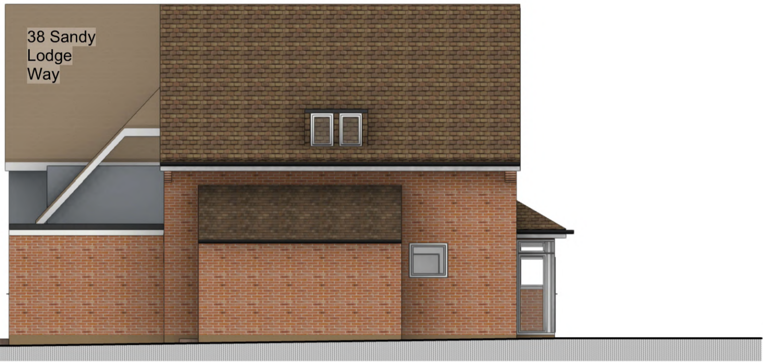
1 01 EXG ELEV SIDE Scale: 1:100