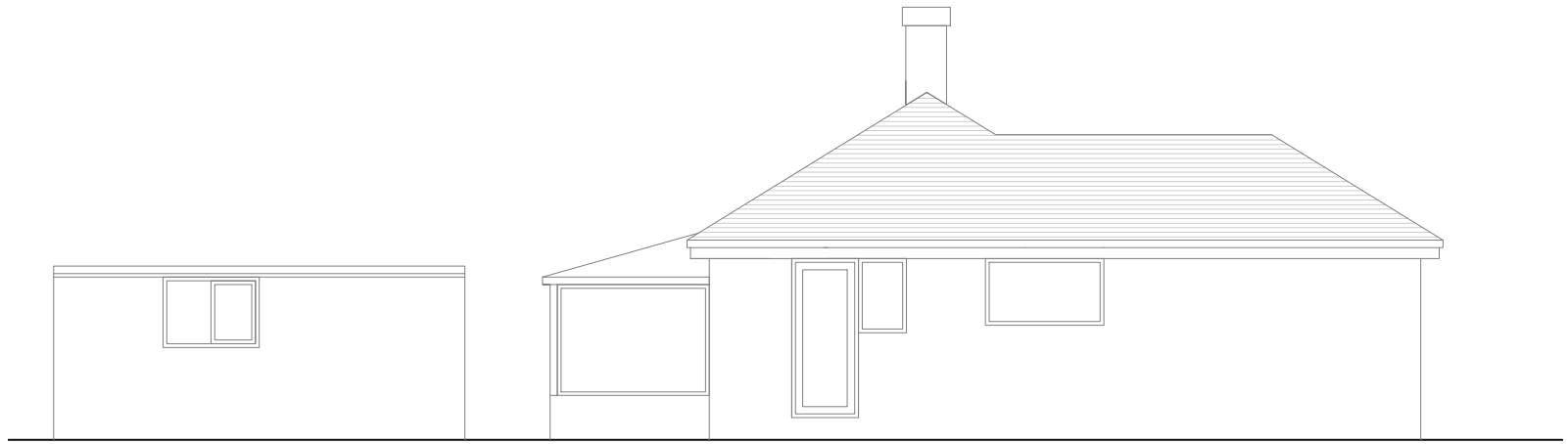
EX Existing Side Scale 1:100