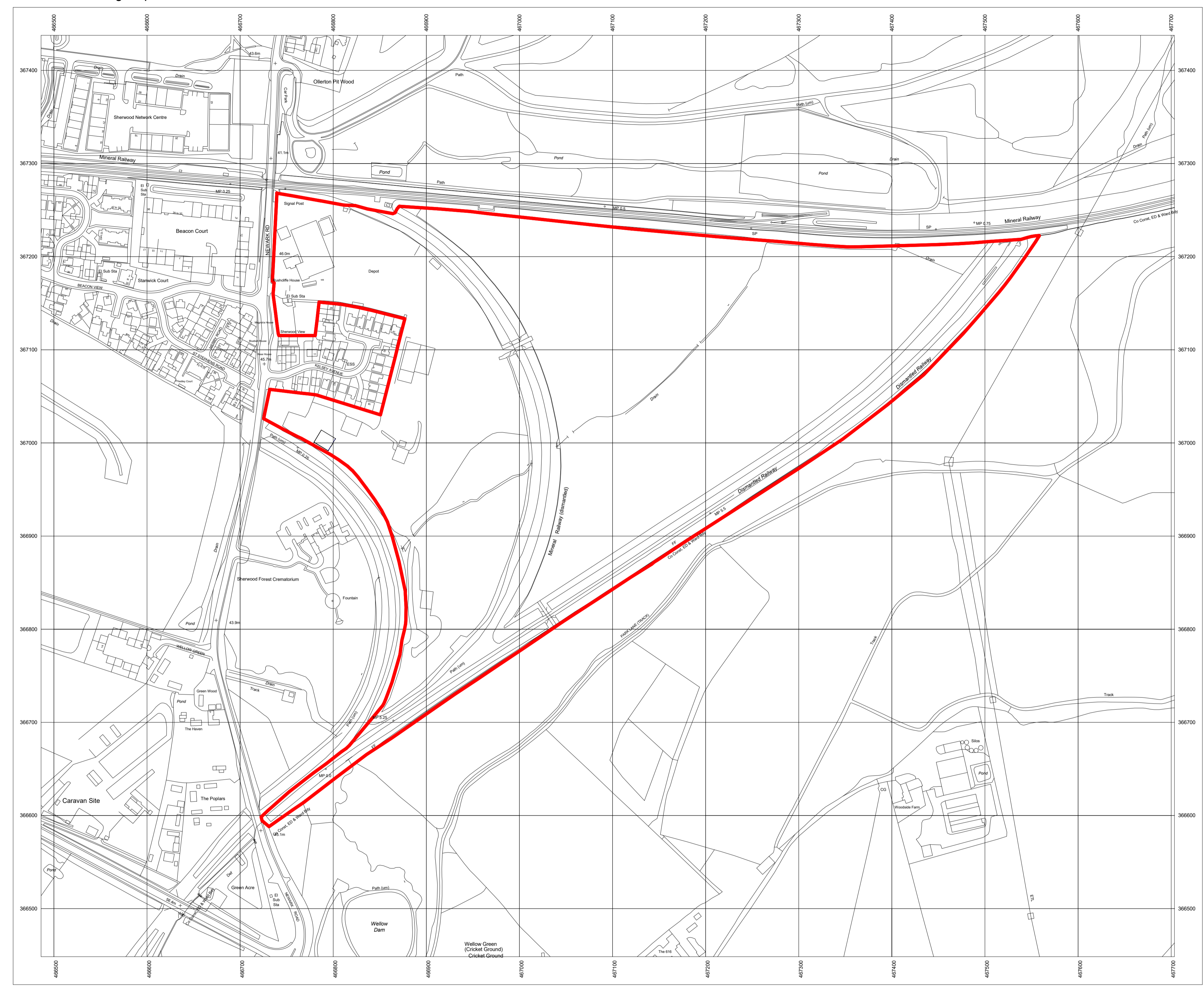
1 Location Plan 1 : 2500

The contractor must check dimensions on site. Only figured dimensions to be worked from.