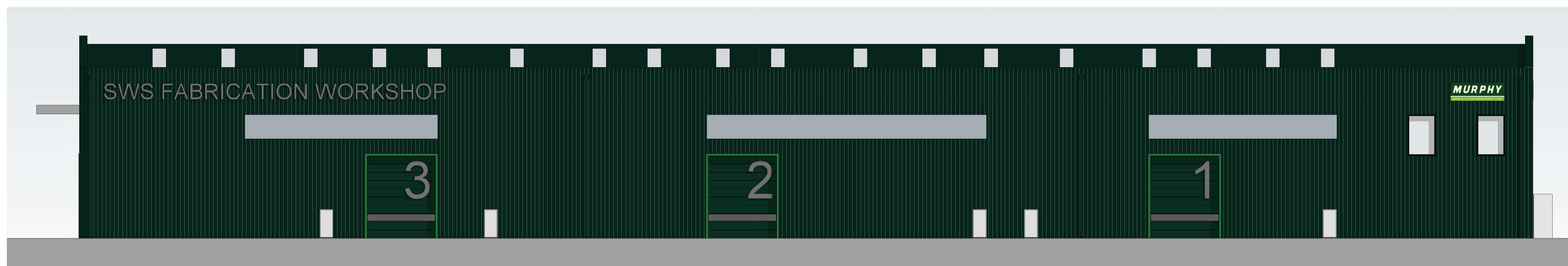
3 North Elevation Copy 1 1 : 200