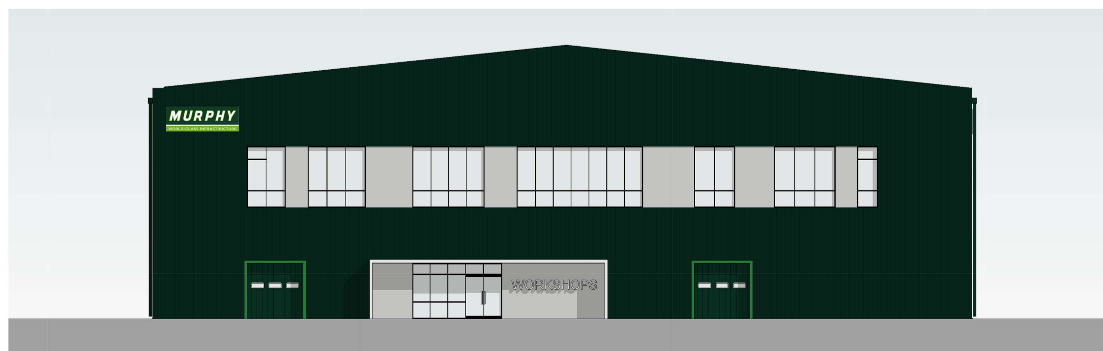
2 West Elevation Copy 1 1 : 200