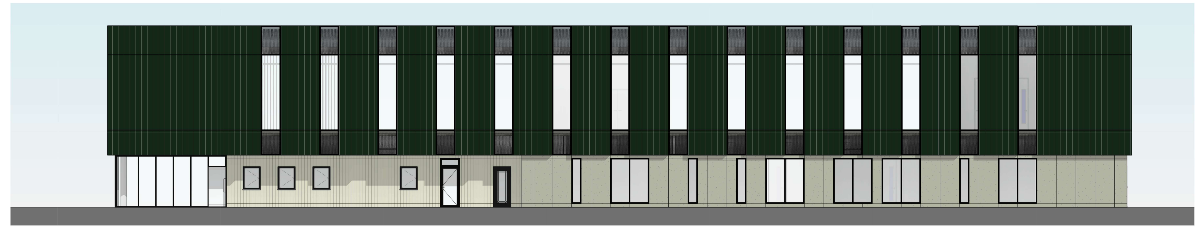
2 East Illustrative Elevation 1:100