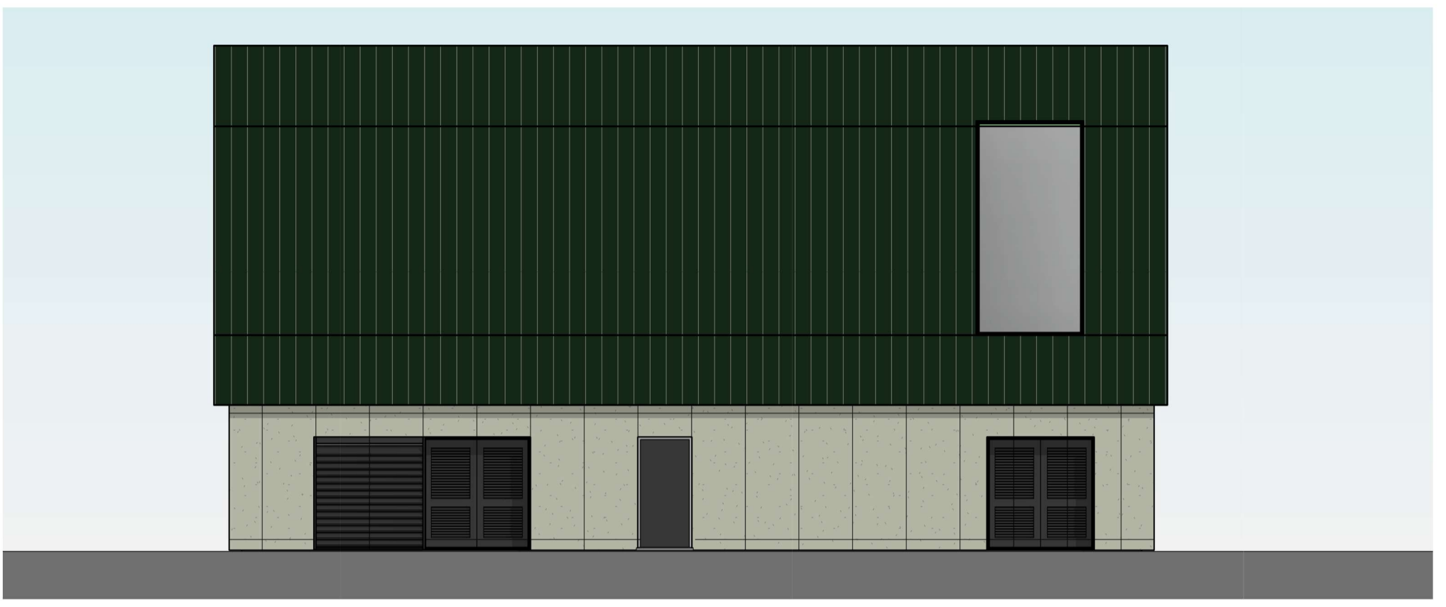
1 North Illustrative Elevation 1:100