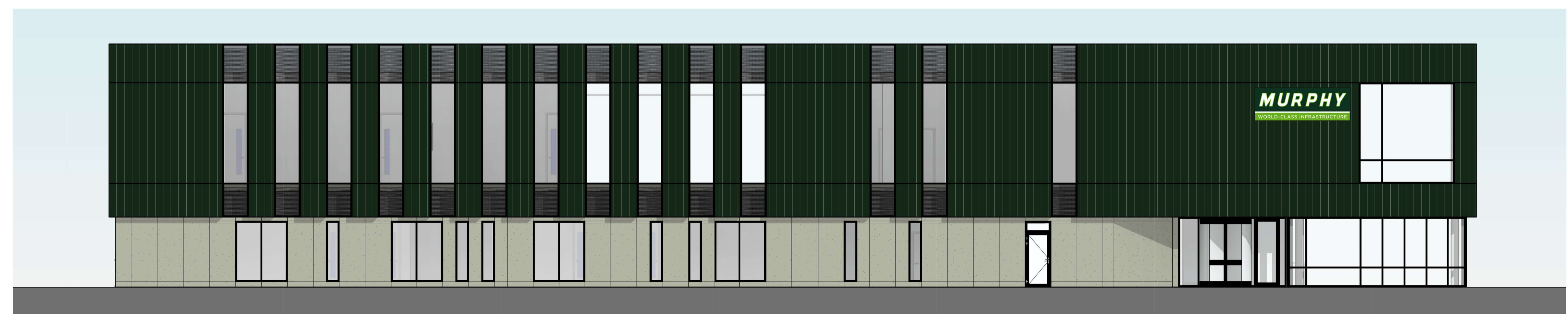
4 West Illustrative Elevation 1:100