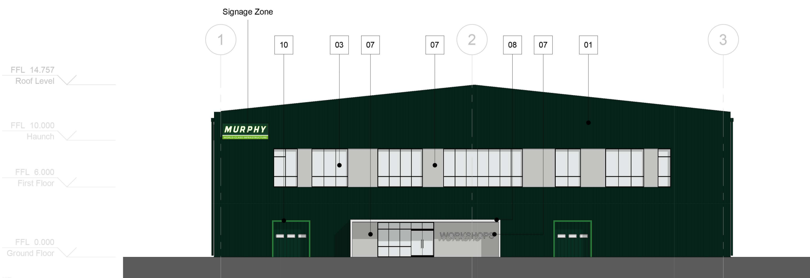
2 West Elevation 1 : 200