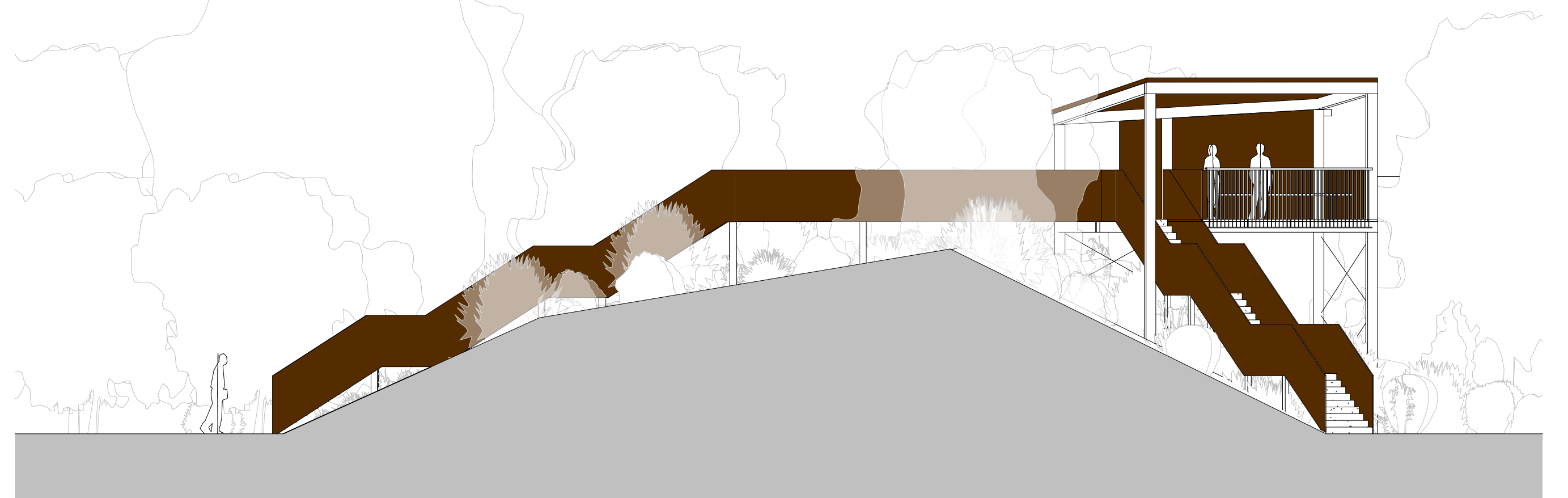
2 North West Elevation 1:100