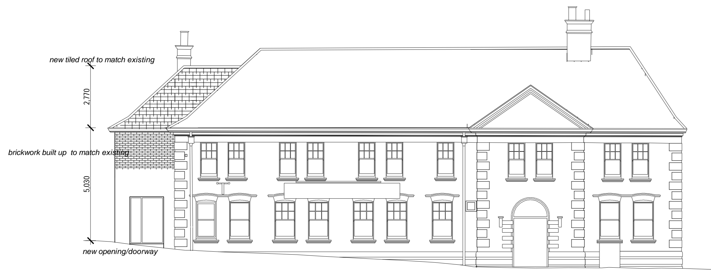
PROPOSED PRINCIPAL ELEVATION (kirklington Rd)