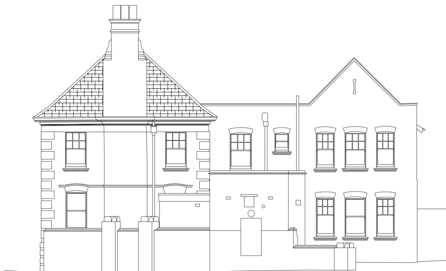
EXISTING SIDE (west) ELEVATION