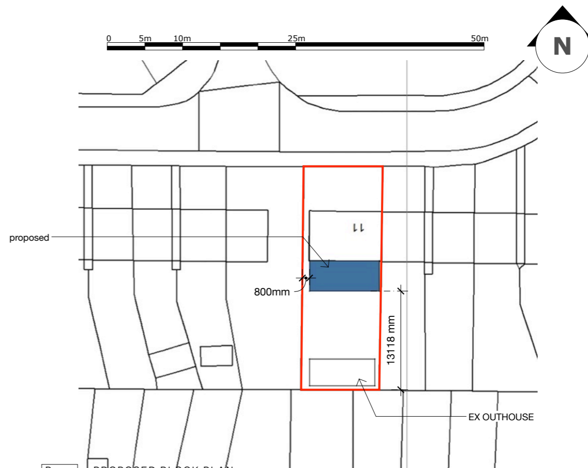
P :: PROPOSED BLOCK PLAN 27 scale: 1:500