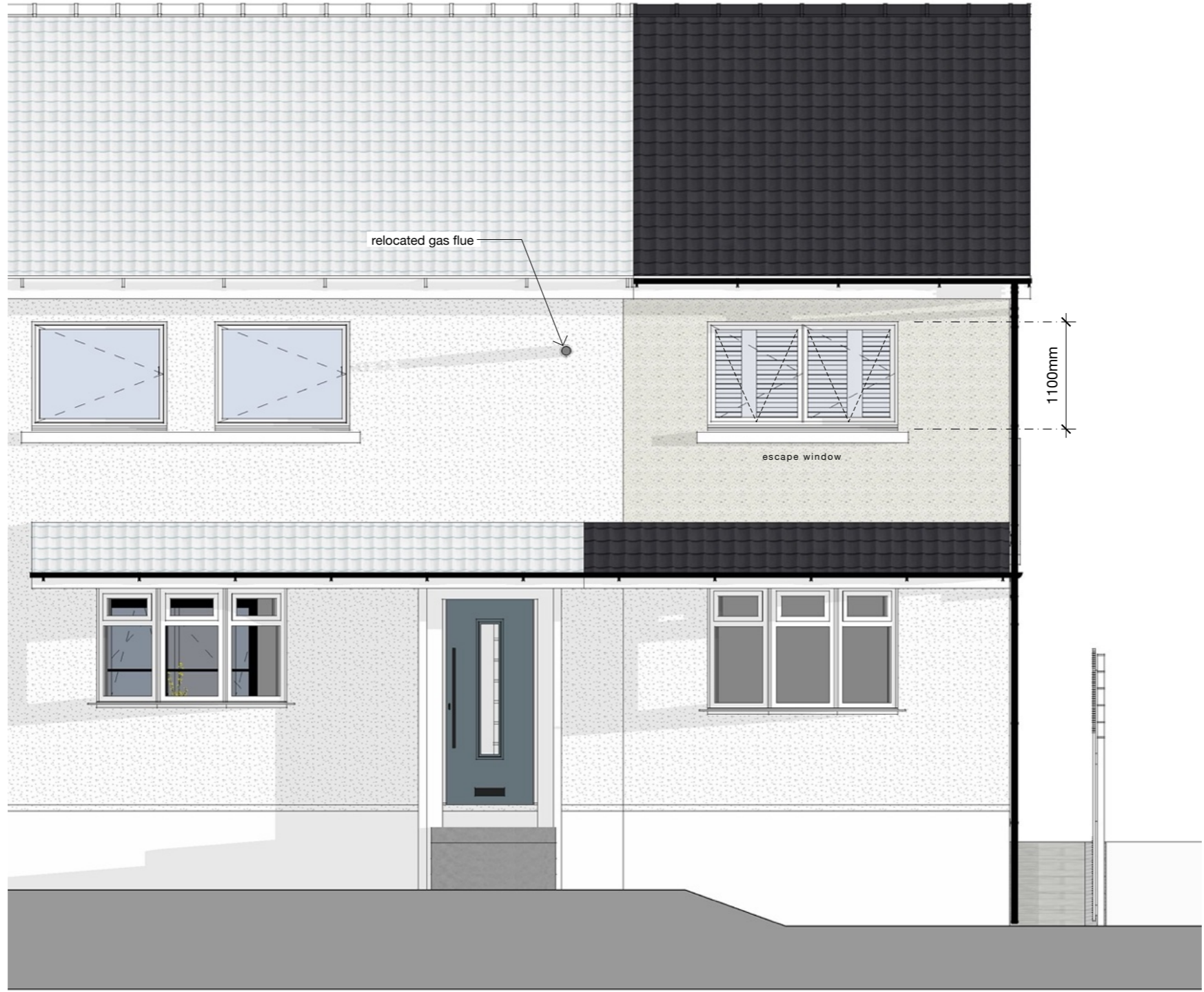
P :: PROPOSED FRONT ELEVATION 7 scale: 1:50