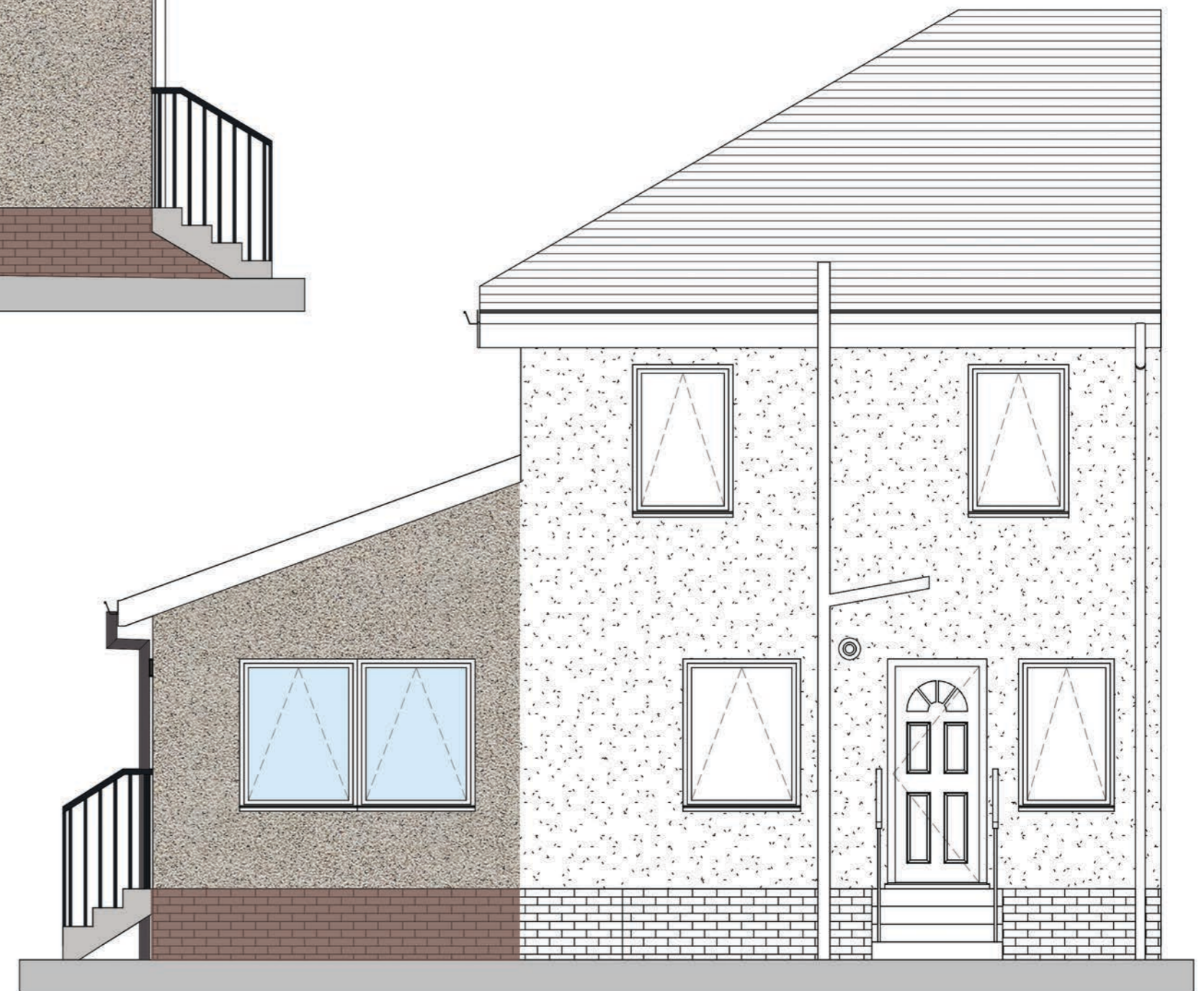
C-C 1 : 50