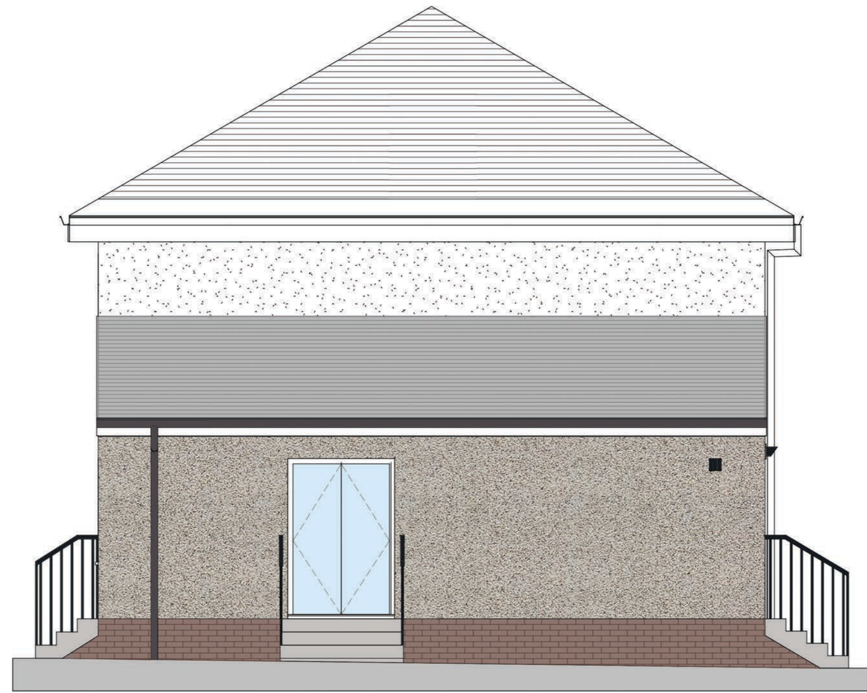
B-B 1 : 50