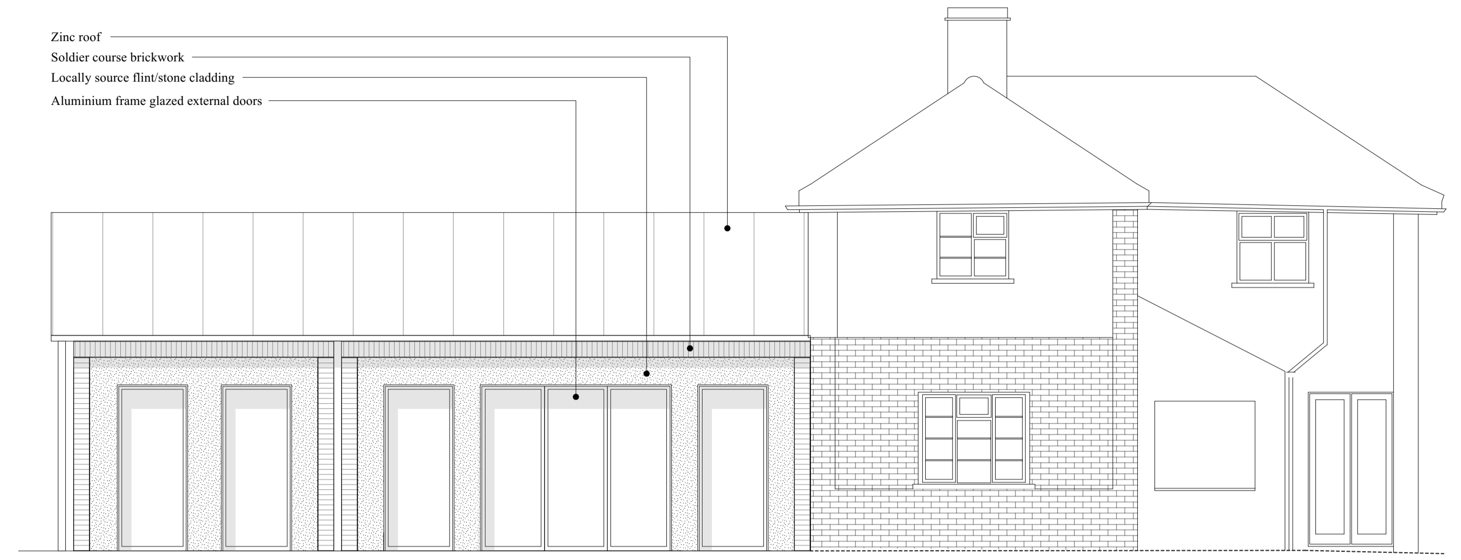
Side (South) Elevation