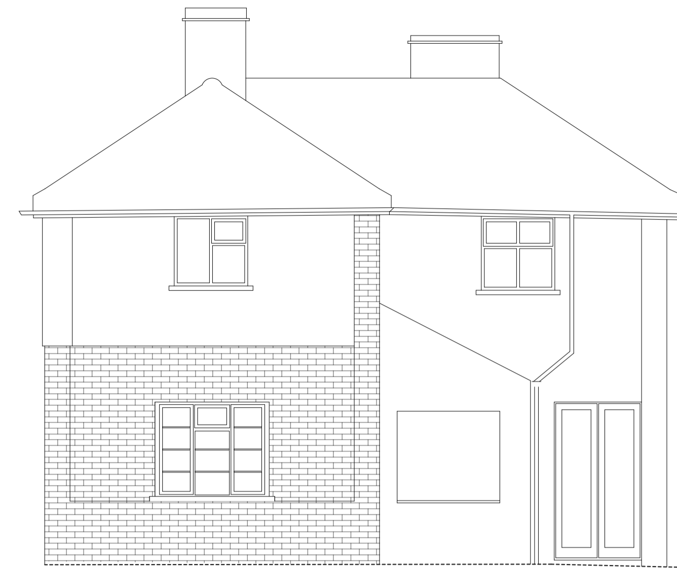
Side (South) Elevation