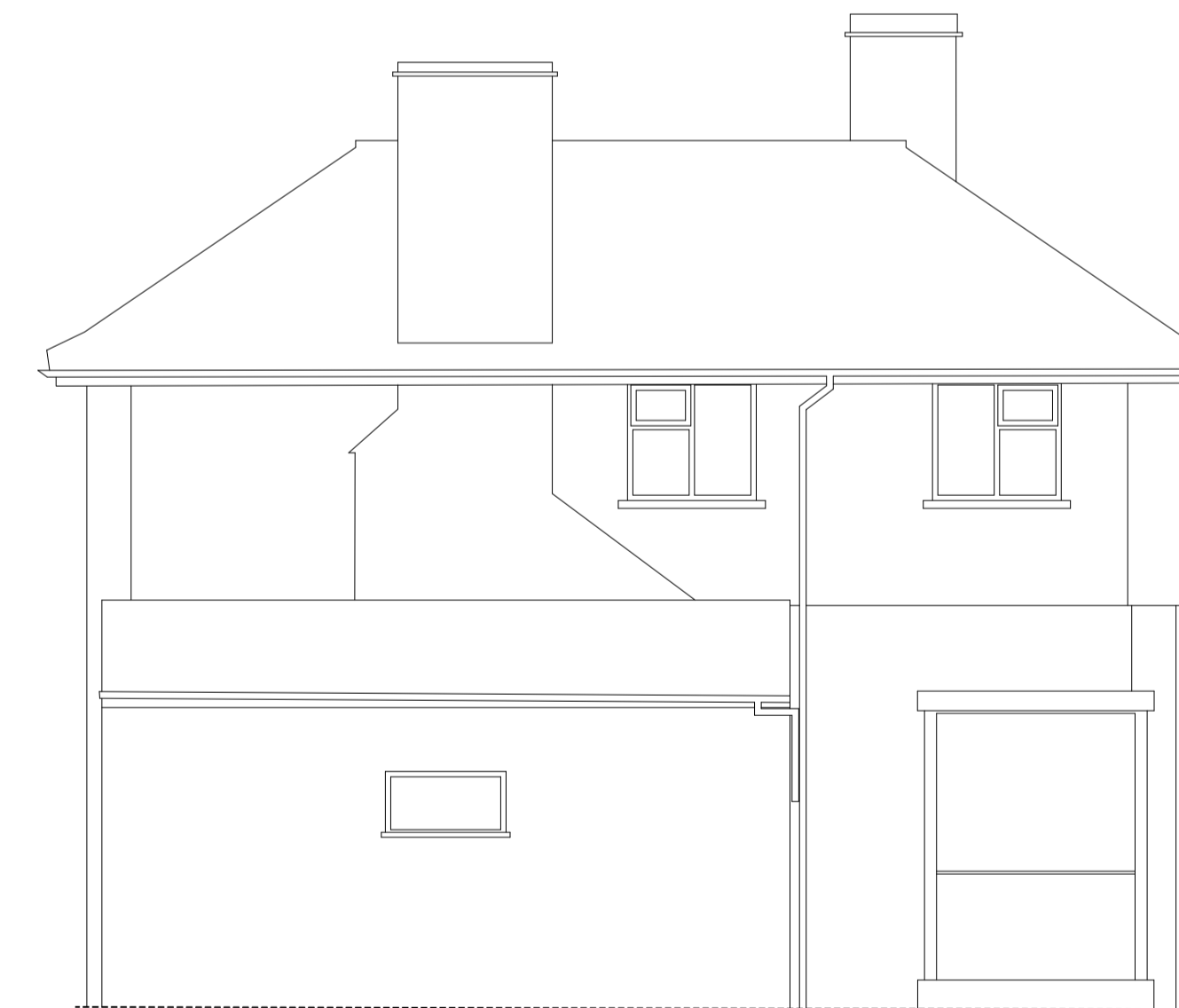
Side (North) Elevation