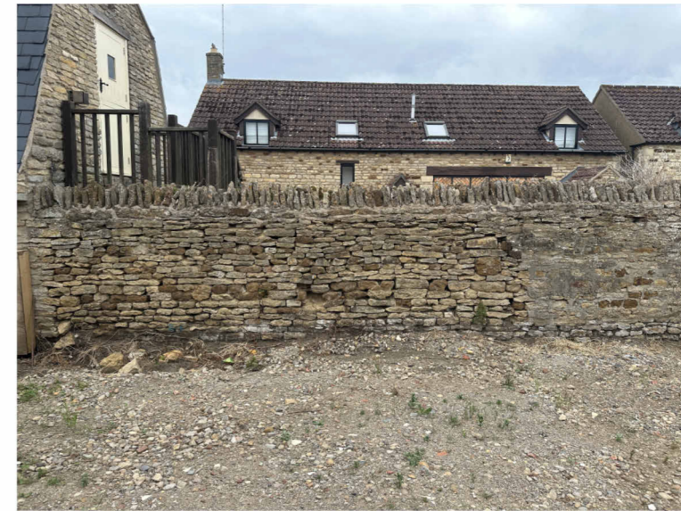
B Existing random coursed limestone wall with cock and hen capping

NEW BORDER/HEDGE PLANTING New borders to be planted with species as indicated. Area of border planting to be cleared of all perennial weeds before new planting. Borders to be dug to a depth of 600mm and made up with good quality topsoil with a silty loam. Soil pH to be checked and any changes to plant choice made accordingly. Plants to be positioned on site still in pots initially to confirm siting taking account of size and shape of individual plants. Planting holes to be dug for each plant approximately twice the size and depth of the root ball. Base of holes to be broken up and mixed with a suitable compost. A root builder to be added in accordance with manufacturers recommendations. On removal from the pot each plants roots are to be teased out and root ball to be placed into planting hole with top of root ball level with top of border soil. Area around the root ball to be filled with border soil. Plants to be gently firmed in by foot and well watered. Newly planted borders to be mulched with decorative gravel.