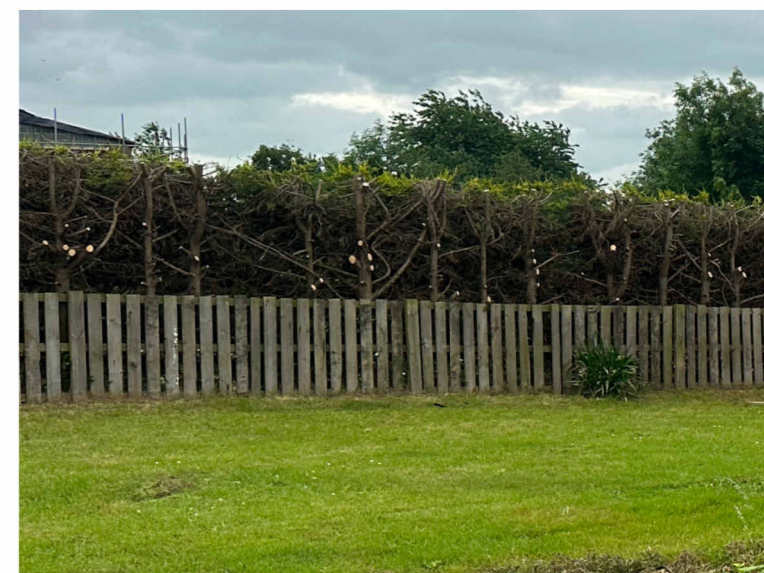
A Existing 1.2m high hit and miss fence and hedge retained