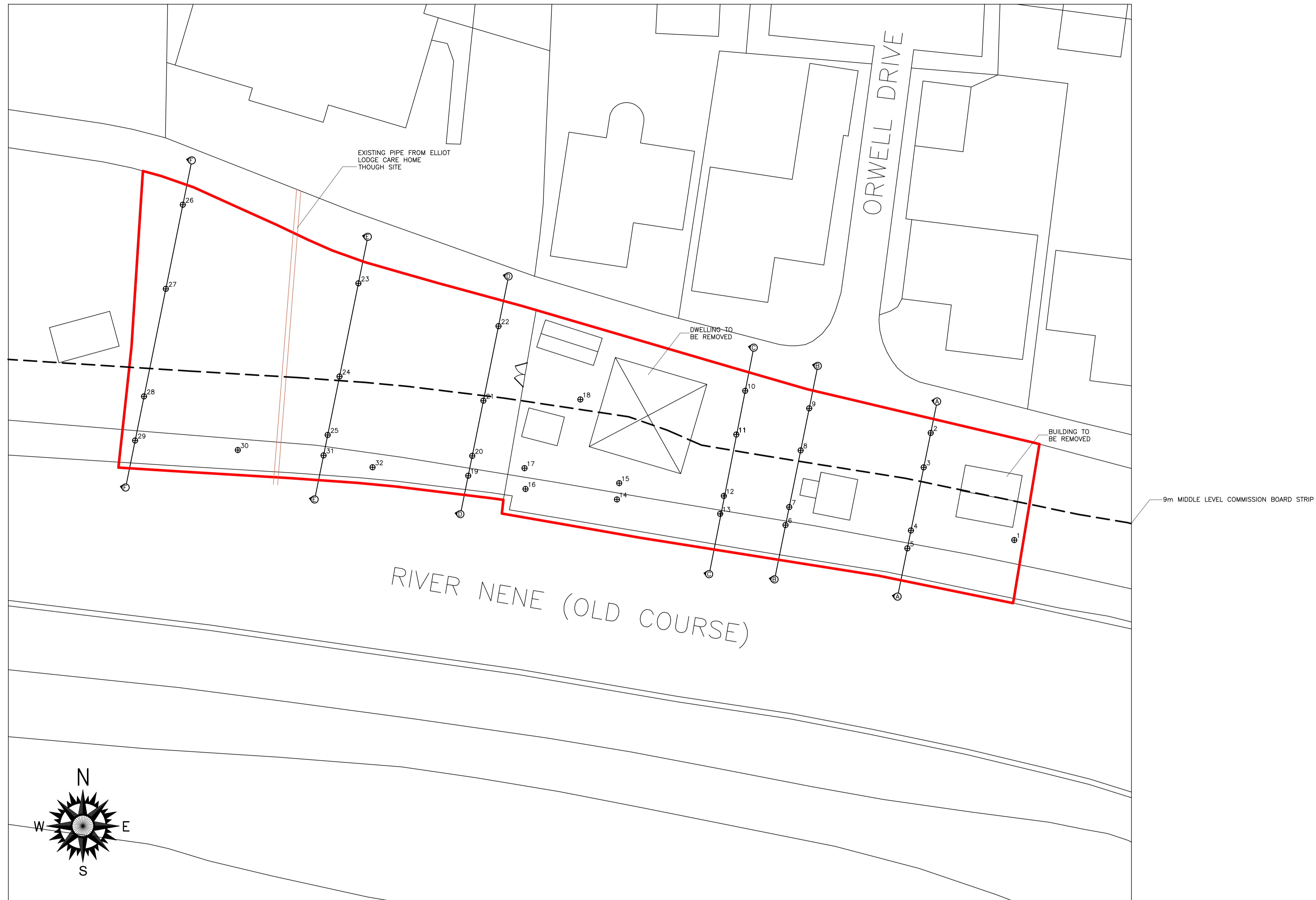
EXISTING SITE LEVEL PLAN (1:200)