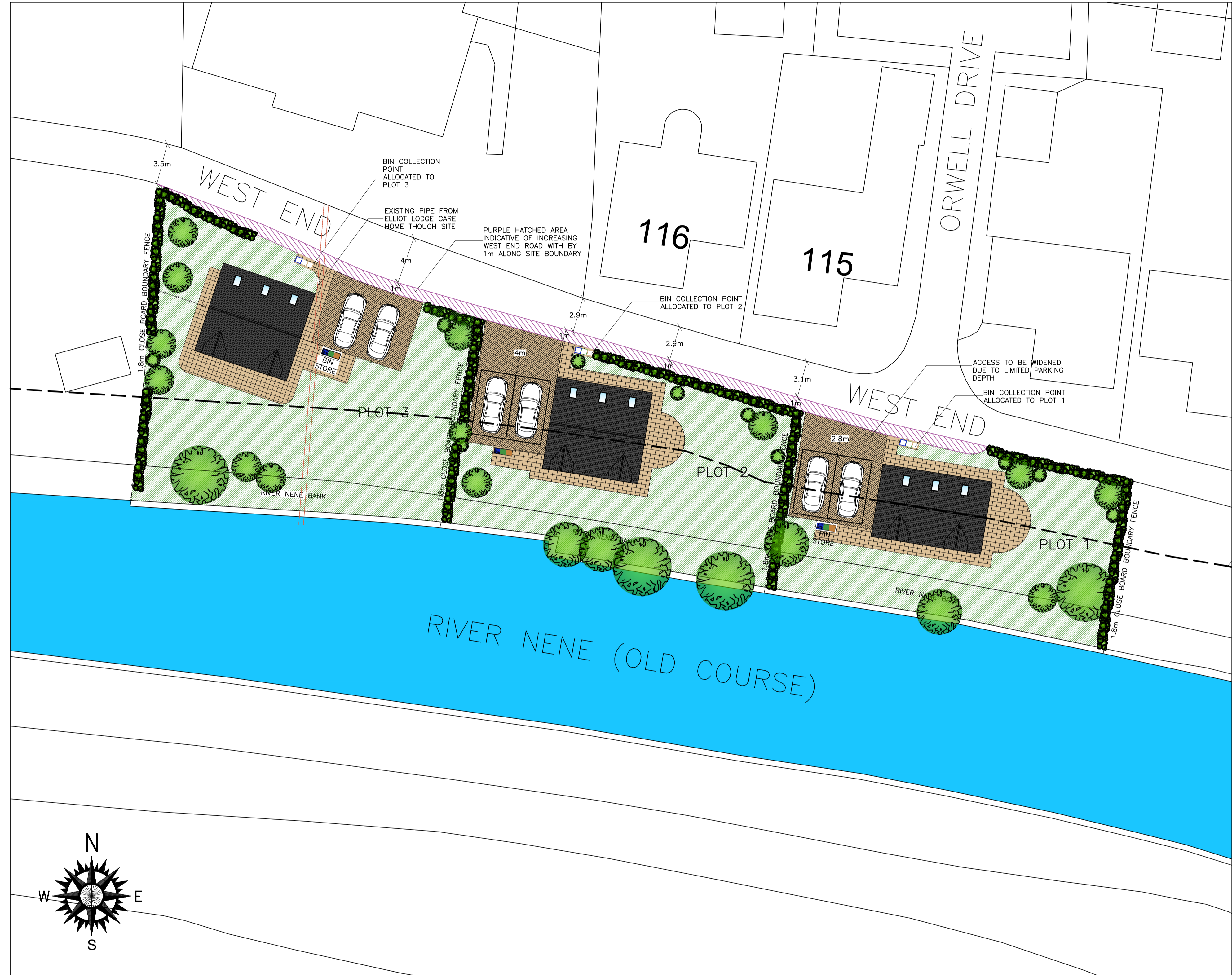
PROPOSED SITE PLAN WITH INDICATIVE LAYOUT (1:200)