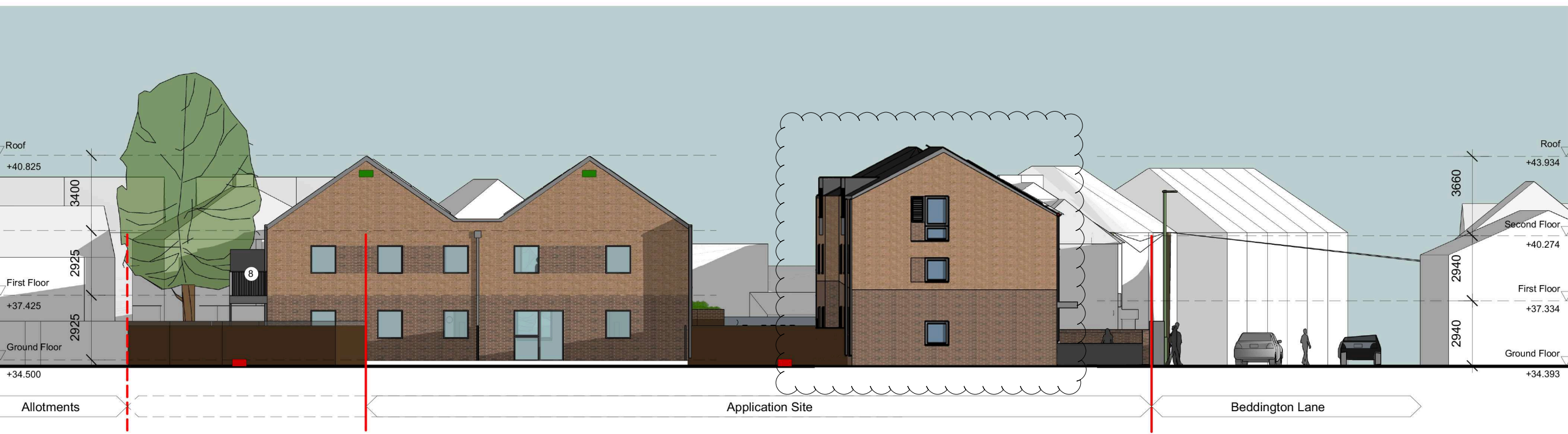
Elevation E - North

Project London Borough of Sutton Social Housing Phase 2c Drawing 30-32 Beddington Lane Proposed Elevations Sheet 2 of 2 Scale 1:200 @ A3 Job n°. Originator_Volume_Level_Type_Role_Number Rev 3025-APLB-XX-XX-DR-A-3014 P07